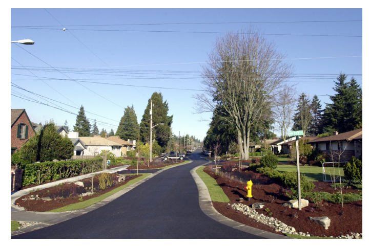
Figure 3: Street after conversion to SEA design.