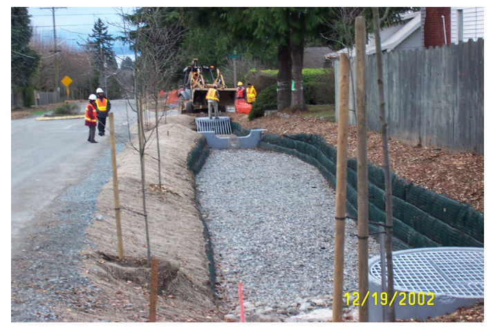
Figure 6. Construction of swale at 110<sup>th</sup> Street cascade pilot project, Seattle, Fall 2003.

from the end of the channel in 27% of the events monitored. It can completely infiltrate the catchment response to about 0.13 inch (3.3mm) of precipitation and 1750 ft³ (50 m³) of influent regardless of the season or conditions. Based on the estimates for the ditch that preceded the Viewlands Cascade project, the new channel reduces runoff discharged directly to Piper's Creek in the wet months by a factor of three relative to the old ditch.