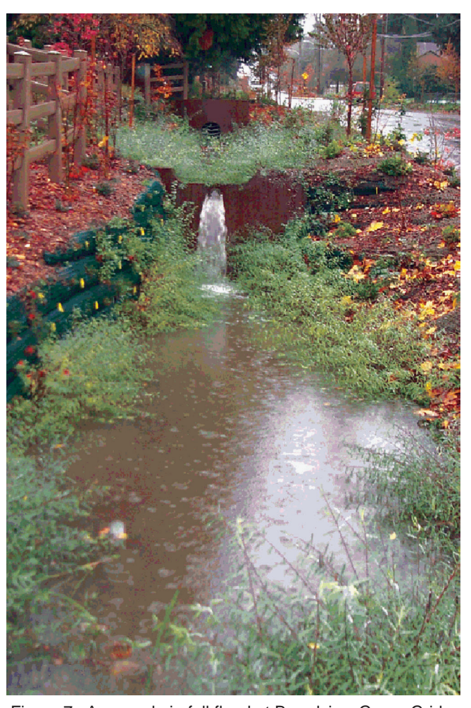
Figure 7. A cascade in full flood at Broadview Green Grid, Seattle, Washington.

The city of Seattle is finding that in addition to providing significant environmental protection, the implementation of natural drainage systems is more cost effective to implement than traditional systems. The reduction of runoff at its source has reduced the need to build and maintain costly infrastructure, such as pipes and holding tanks. It also mitigates the pollution of local waterways, thus lowering costs to the city in