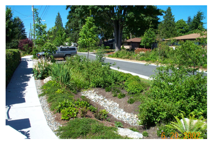
Figure 5. Swale as part of SEA street design.

The engineered soil has infiltration rates between 1.5 to 2 inches per hour at 85% compaction and is most typically used in the Cascade systems. It is generally composed of 50-60% sandy material, 25-30% compost, and 15-20% sandy loam topsoil.