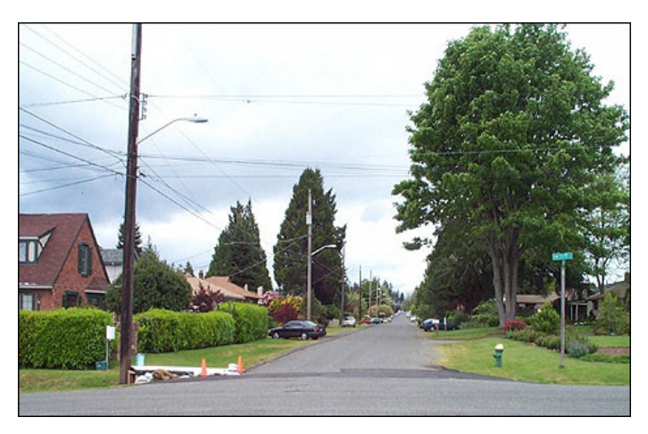
Figure 2: Street before conversion to Street Edge Alternative (SEA) design.

Street Edge Alternative (SEA) street design consists of a series of shallow, generally flat-bottomed, heavily vegetated swales placed along a gently curving street (see Figures 2 through 5). This type of system is considered to be a source control strategy because it manages the stormwater runoff from the immediate surrounding area. The system infiltrates and detains stormwater to maximize the water quality and flow control benefits. The bottom widths of the swales will vary depending on the amount of room available, but at least a 2foot bottom width is recommended and not more that 4-feet in depth. Side-slopes are graded at 3:1 along the road, but may be slightly steeper on the property side. Generally, these systems attempt to treat all runoff in the immediate basin from the 6-month, 24-hr storm by filtering the stormwater through vegetation and infiltrating the water through the soil media. The stormwater flow control goals are to maximize retention, infiltrating at a minimum all flow generated by a 1/2-inch storm event, and maximize detention, ideally detaining the developed 1-2 year storm event for the adjacent drainage area to predeveloped forested conditions.