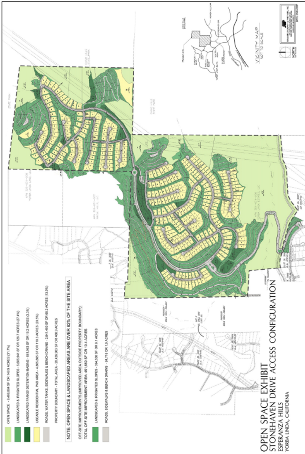
Exhibit 14 - Open Space