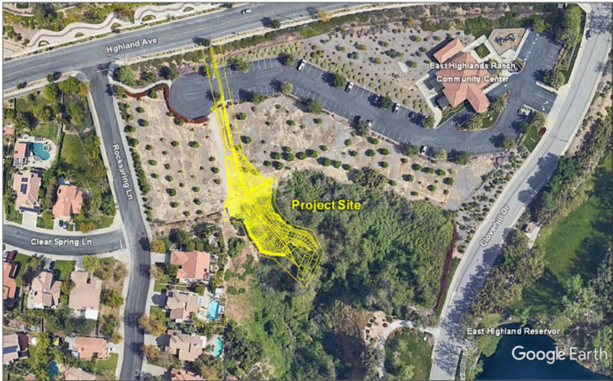
Figure 2. Map of Project Area Limits