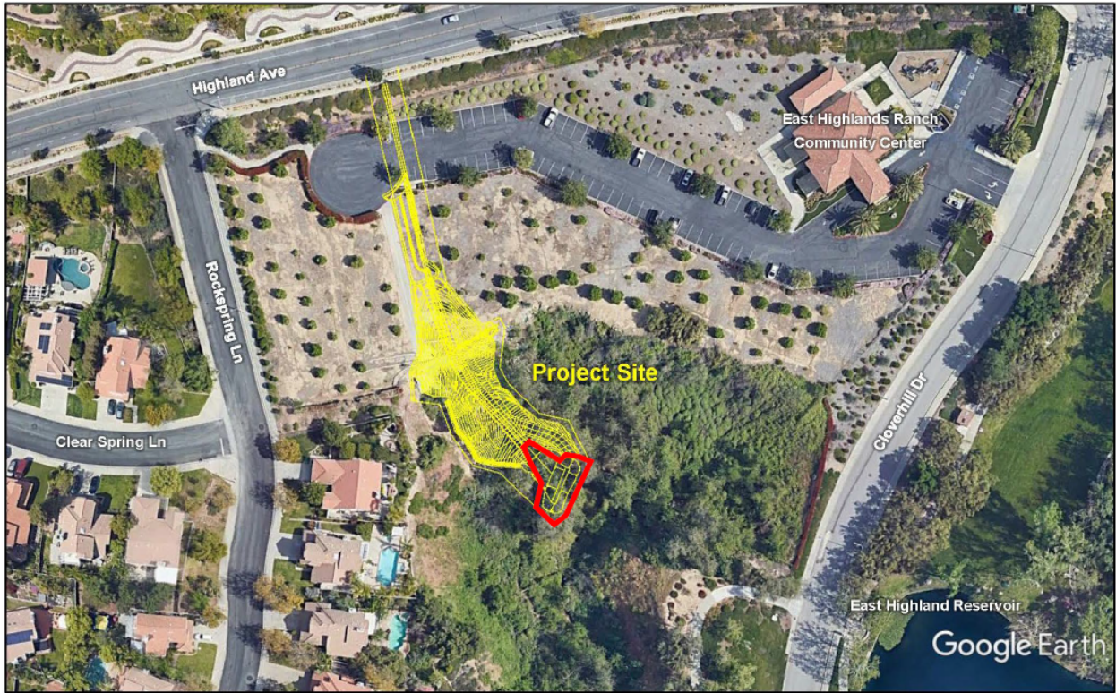
Figure 3. Limits of Waters of the State in Red Area