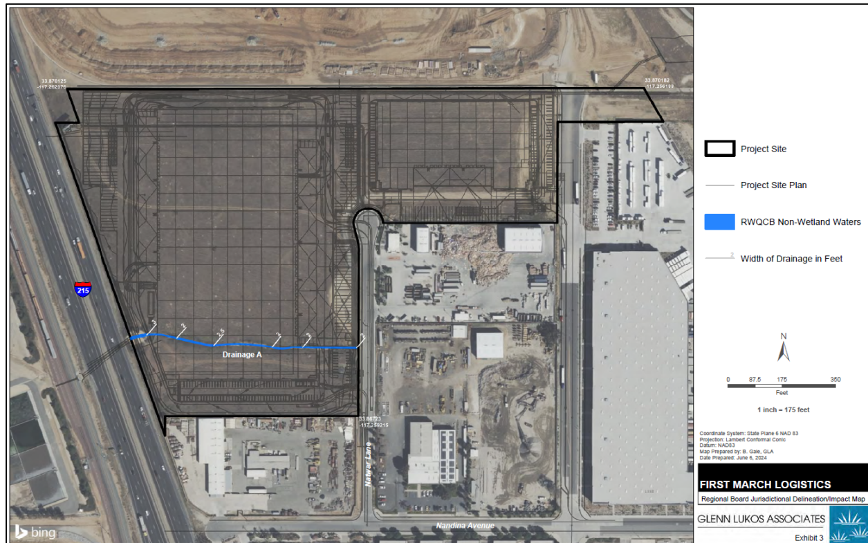
Figure 2: Waters of the State/Impact Map