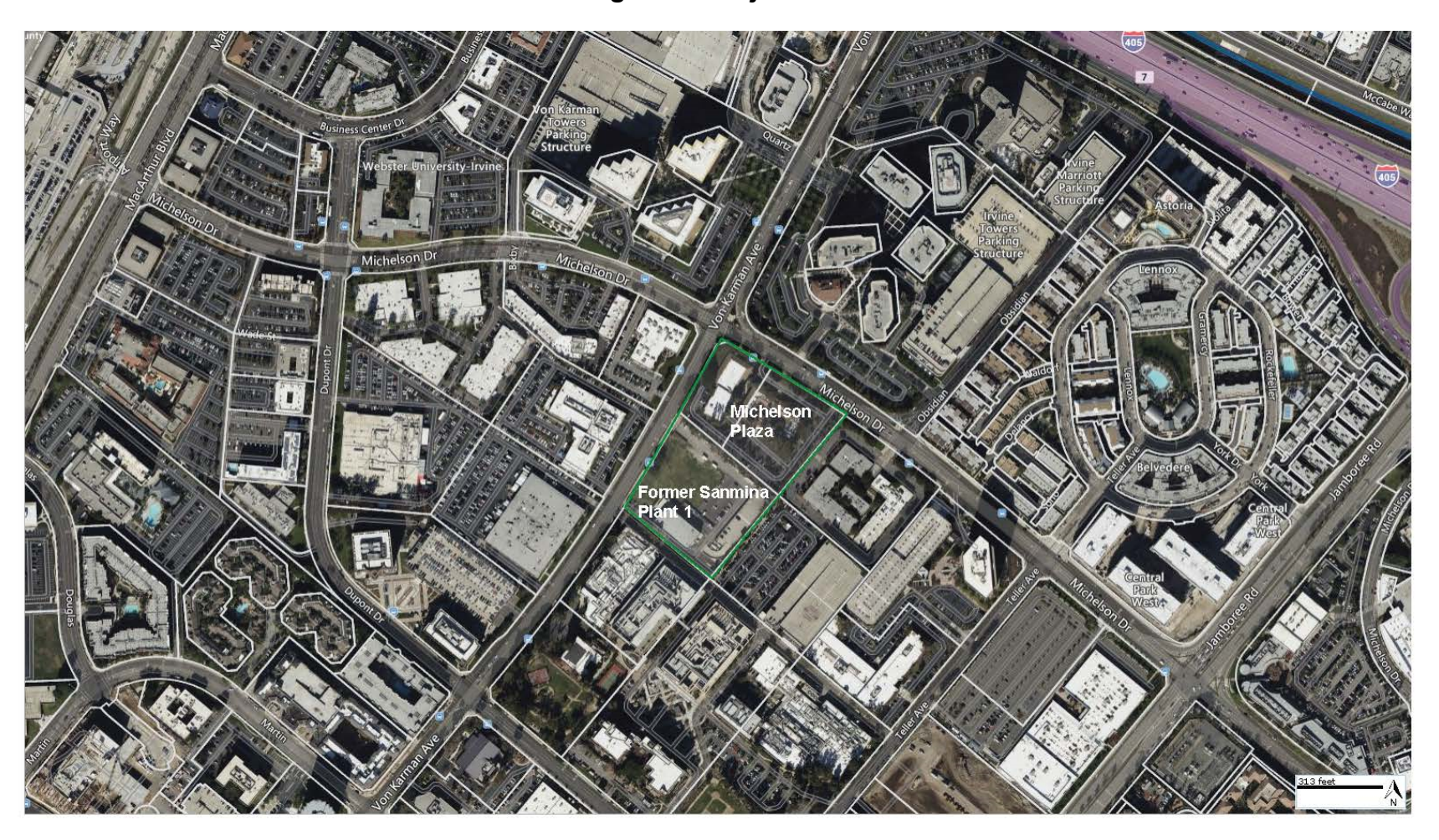
Figure 1: Project Site