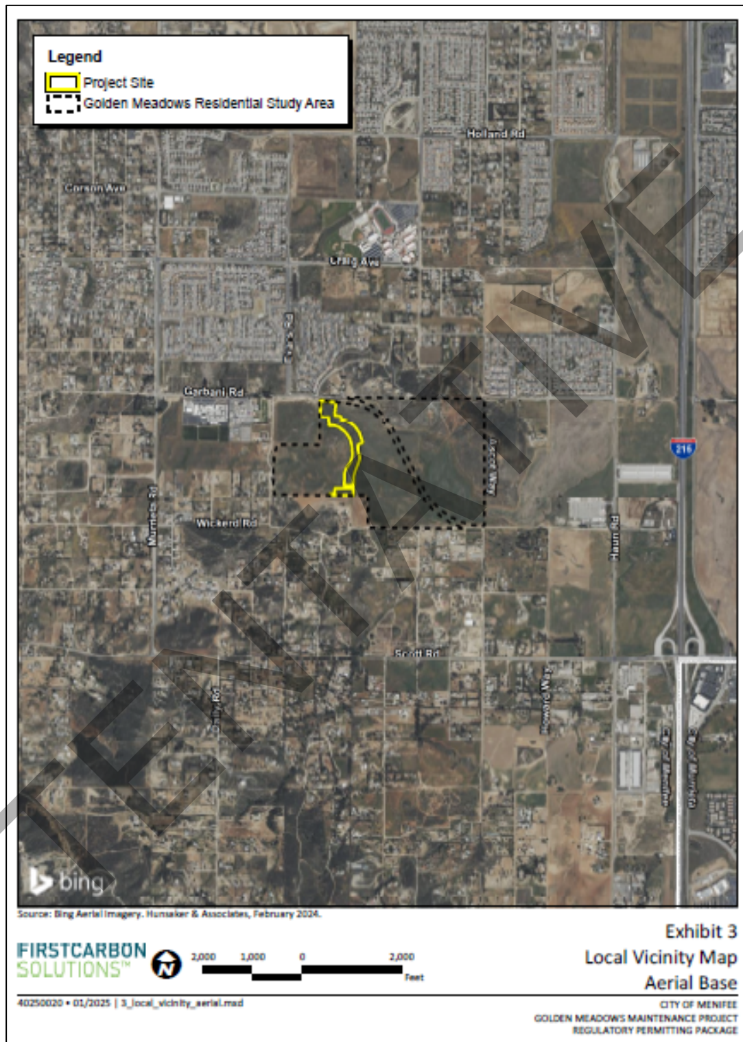
Figure 3: Local Vicinity Map Aerial