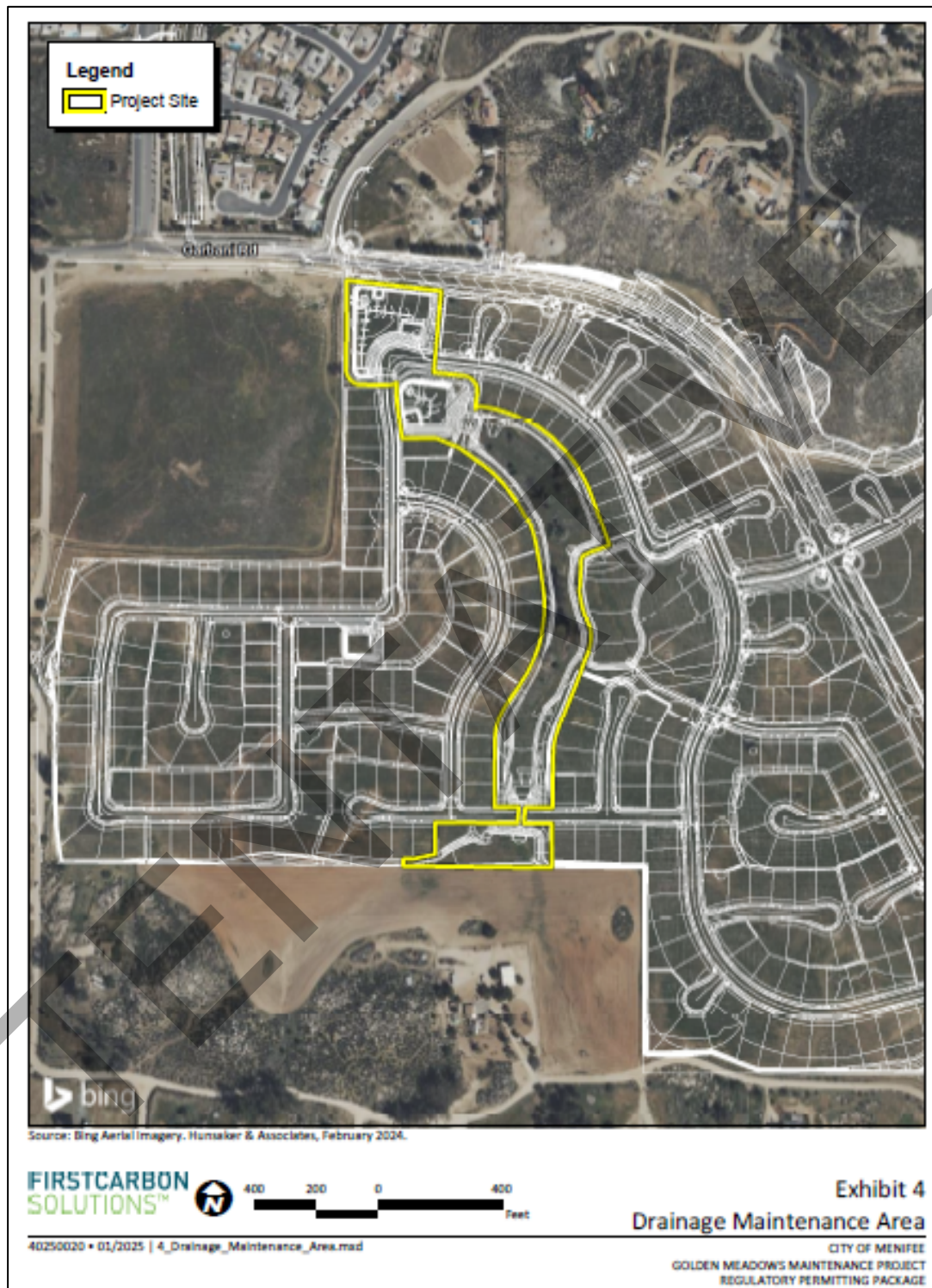
Figure 4: Maintenance Area