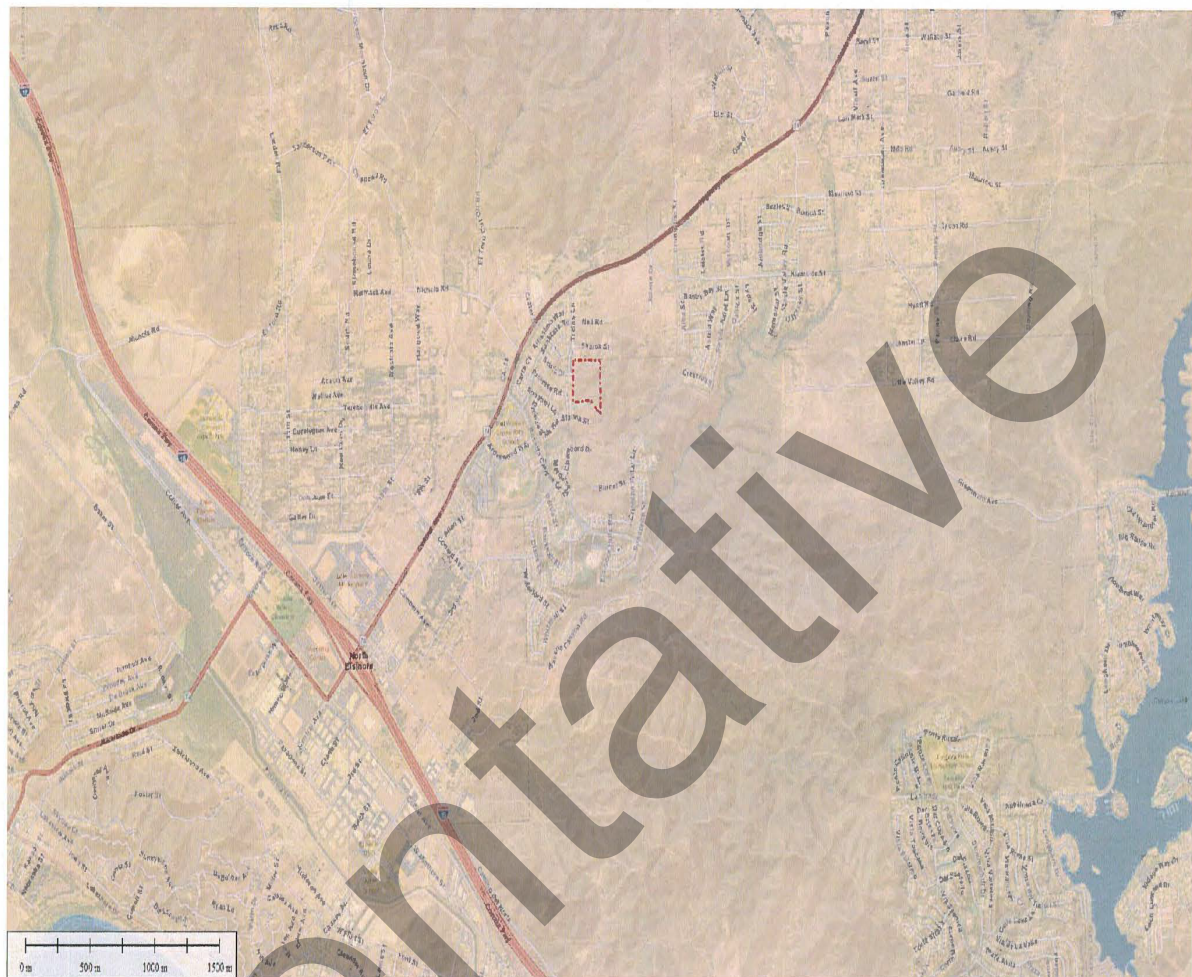
Figure 1 Location Map Tentative Tract Map 32912 City of Lake Elsinore Riverside County, California