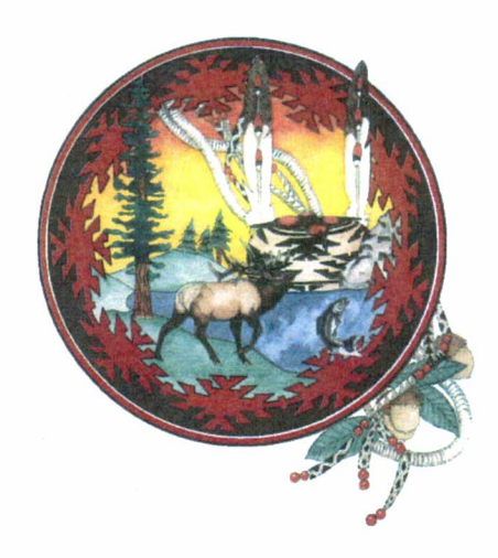
November 6, 2018

2332 Howland Hill Road Crescent City, CA 95531