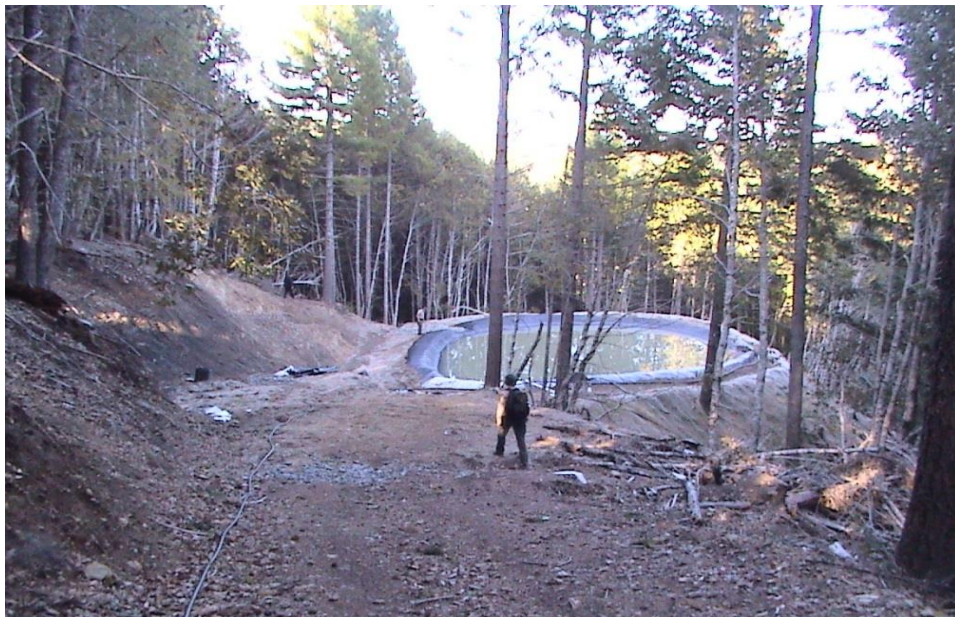
Figure 3. CDFW personnel inspecting an unpermitted pond found adjacent to a marijuana cultivation site. This pond captured and diverted all the water from a small tributary to an important salmon and steelhead stream.