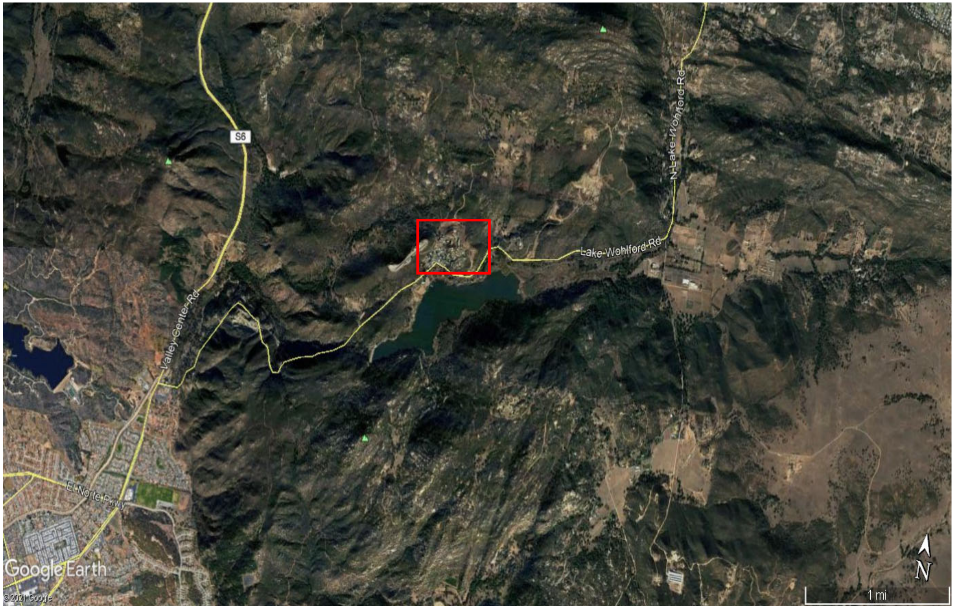
Figure 1—Project Vicinity - Lake Wohlford Resort