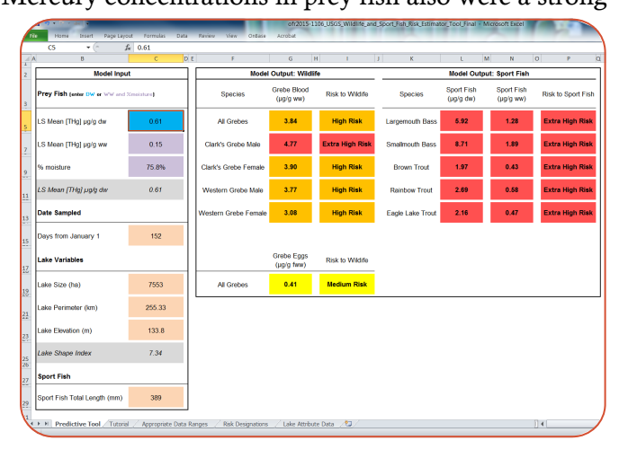
Figure 2. Screenshot of a tool that can be used to estimate mercury risk to grebes on a statewide basis in California lakes.

predictor of mercury concentrations in sport fish. Using a statistical approach, equations were developed to predict mercury concentrations in bird blood, bird eggs, and sport fish based on mercury concentrations in prey fish, sampling date, and lake attributes. These equations served as the foundation for a tool (Figure 2) for natural resource managers and regulators to use for estimating lake-specific risk of mercury to wildlife and sport fish. This tool, which can be downloaded at: <a href="http://www.werc.usgs.gov/">http://www.werc.usgs.gov/</a> mercuryriskinlakes, can be used to estimate mercury risk to grebes on a statewide basis in California lakes. Managers interested in using the tool are encouraged to read the supporting information on the project web page and contact the principal investigators to understand the tool's strengths and limitations. Although this tool can be highly useful in estimating levels of risk, there is still no