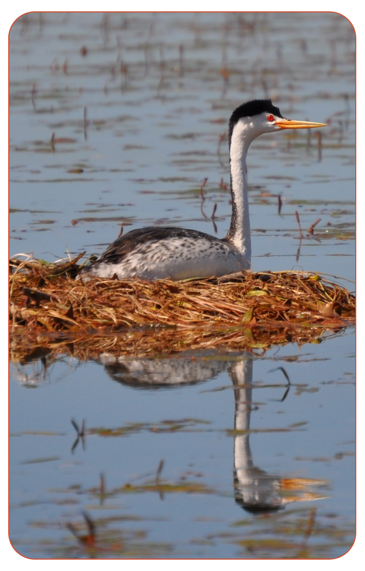
Nesting Clark's grebe.

This study was performed to address critical information gaps related to mercury risks to wildlife in California lakes. Western grebes and Clark's grebes were chosen as the wildlife indicator species. These grebe species are widely distributed and breed in lakes throughout California, are piscivorous (fish-eaters) near the top of the lake food chain, and become flightless after they arrive at their summer locations. This makes them excellent indicators of lake-specific contaminant exposure. Mercury concentrations were measured in grebe blood at all of the lakes, and in grebe eggs where they could be collected. Mercury also was measured in the small fish species that grebes eat and in sport fish in order to determine whether correlations between fish and grebes could be used to estimate risk to grebes in cases