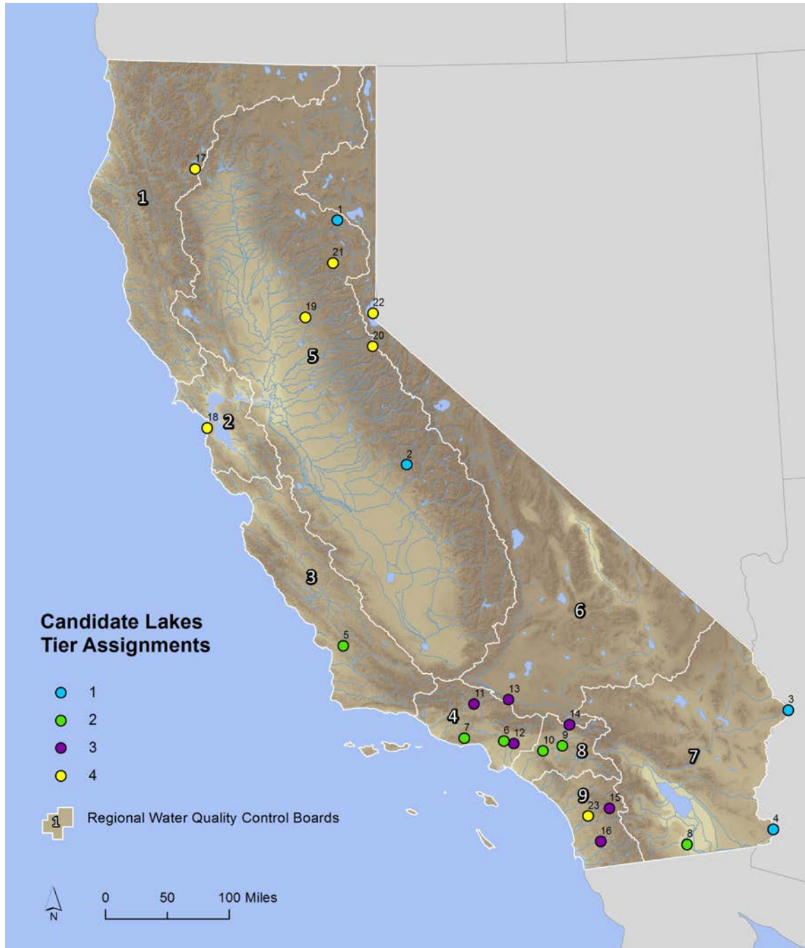
Figure 1. Map of sampling locations. Lake names are indicated in Table 5.