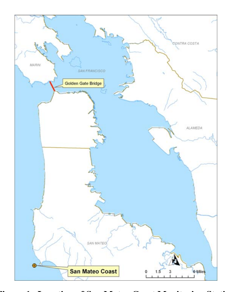
Figure 1. Location of San Mateo Coast Monitoring Station

Based on our review, it appears that the data used does not meet the Data Quantity Assessment standards contained in Section 6.1.5 of the Water Quality Control Policy for Developing California's Clean Water Act Section 303(d) List , adopted September 2004 (Policy). More specifically, Section 6.1.5.3 of the Policy states: