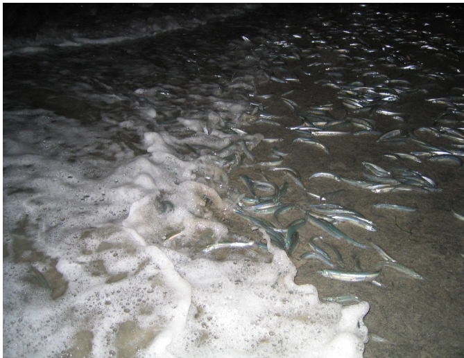
Grunion run at Ocean Beach, San Diego County (2004)