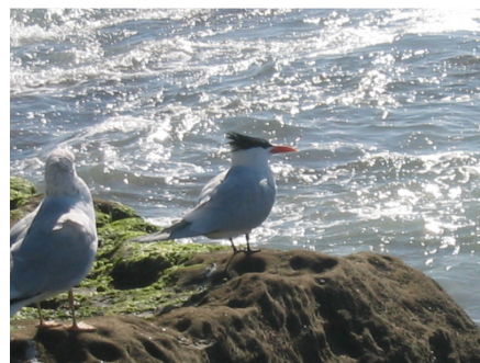
Elegant tern and seagull south of Children's Pool, San Diego County (2006)