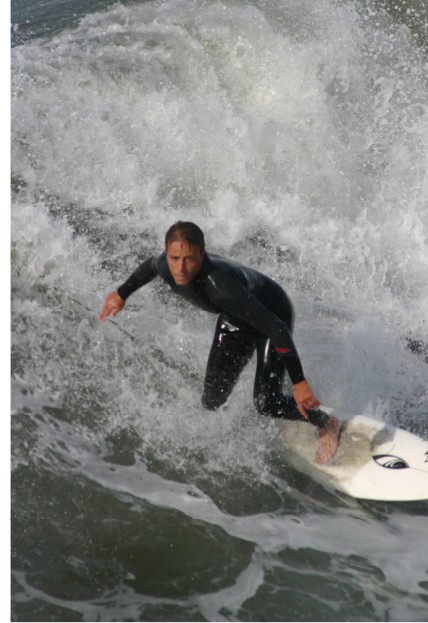
Surfer at Ocean Beach, San Diego County (2003) by Ed Chan