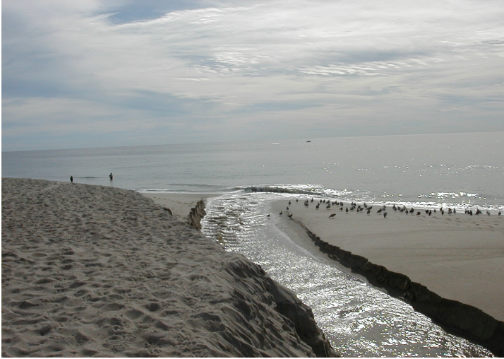
Aliso Beach, Orange County (2002) by Christina Arias

This amendment will revise the indices, table of contents, glossary, page numbers, and graphics in Chapter 3 (Water Quality Objectives) and Chapter 4 (Implementation) to reflect updates to text. The photographic images below will be added as graphics as well.