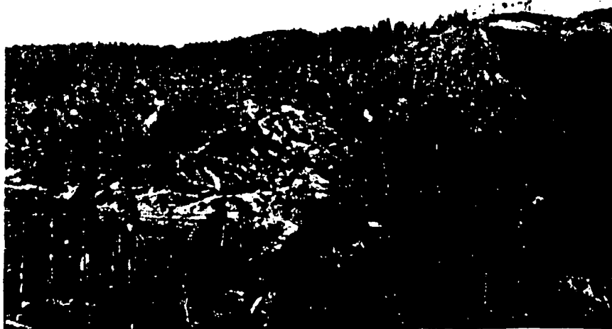
PHOTO 1. (December 1978): View to north looking across the Cloquet Creek drainage at the patterns of ground disturbance created by two different logging methods. The steeper slope on the right (east) was logged by cable yarding, and the more gently sloping terrain on the left (west) was logged by Caterpillar tractors that build numerous skid roads (see text).

The remaining unlogged timber stands in the vicinity occur mainly on the steepest and most inaccessible slopes and would have been the most difficult to log. Throughout the Park, the remaining timber occurs in similar sites, and at the time of Park expansion, logging was proceeding on the most erosionally sensitive terrain.