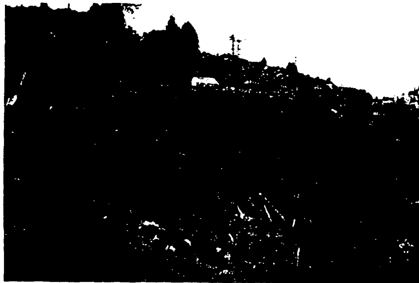
PHOTOS 2 and 3. (September and December, 1978): Log landing in the Miller Creek drainage on the C-line before and after rehabilitation by heavy equipment and manual labor crews. The outer part of the landing failed about 5 years ago and left a perched scarp of soil and organic debris above the stream. Heavy equipment removed the perched material, recontoured the slope, and manual labor crews then planted and wattled the slope (see text).