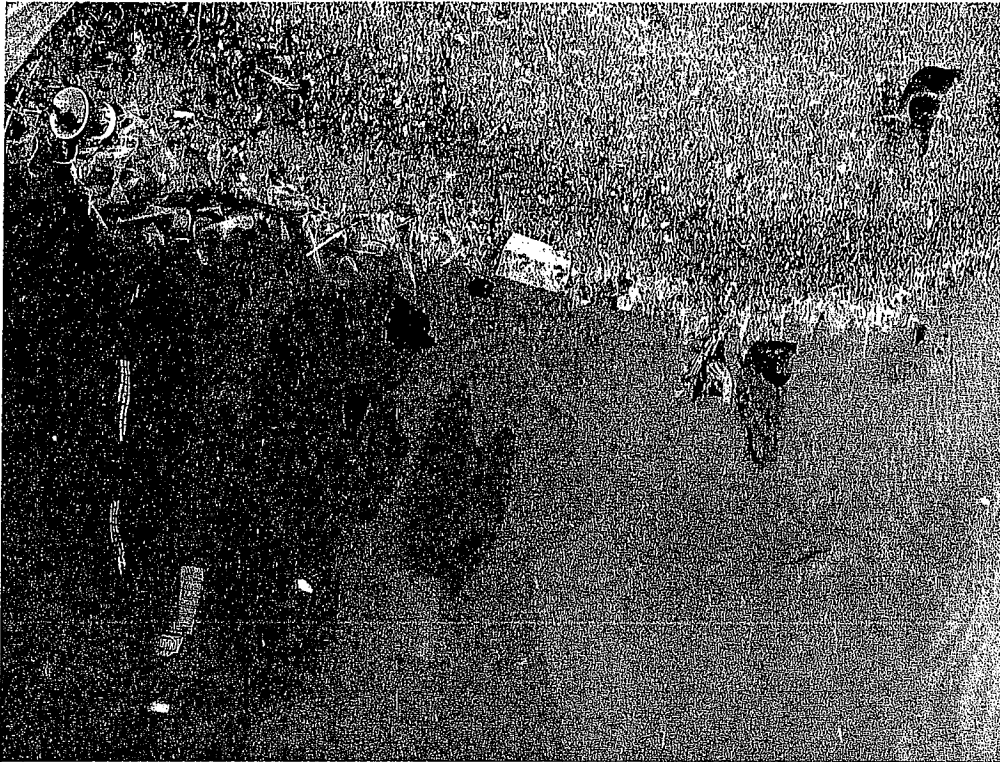
Figure 4. Photograph of trash and bird feathers floating on the water's surface near shore.