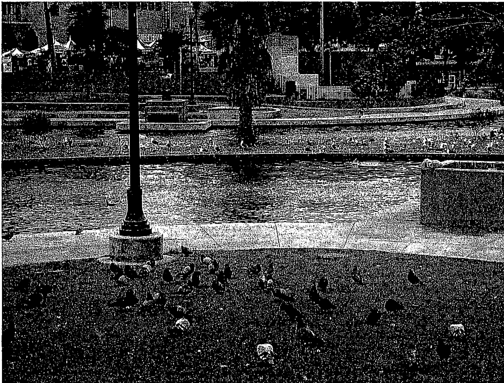
Figure 5. Photograph of pigeons in the foreground and ducks and gulls in the distance.