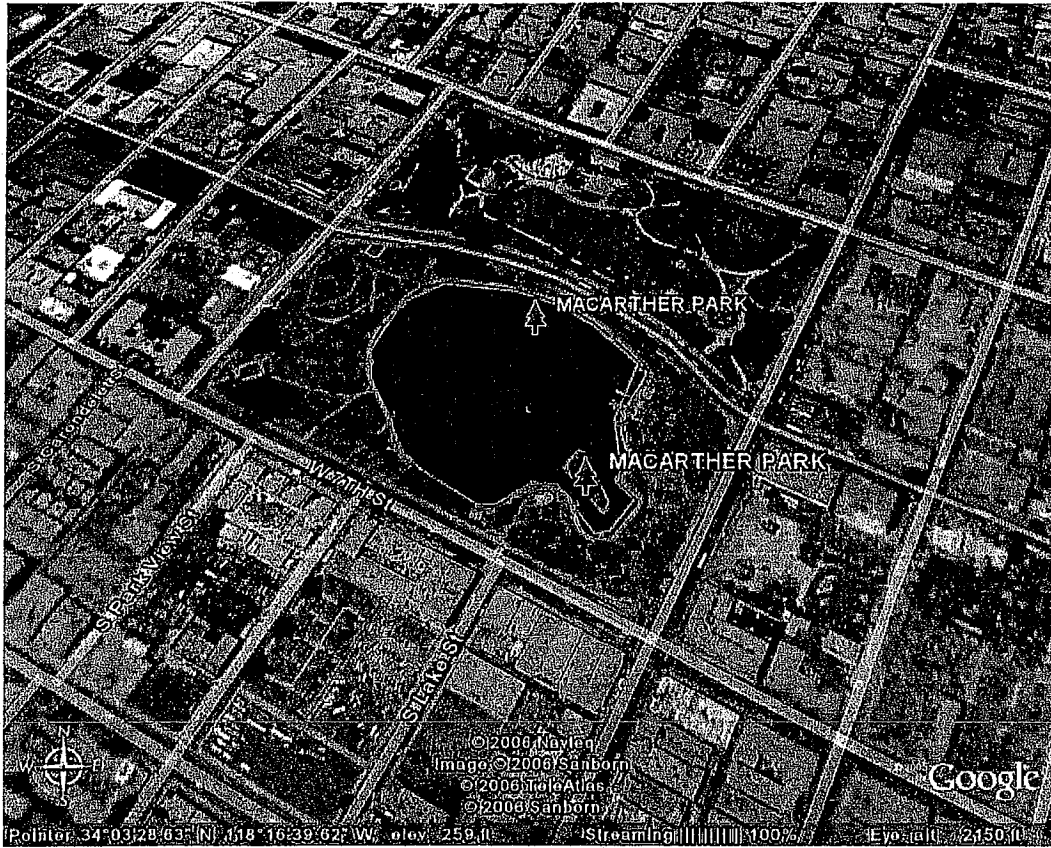
Figure 1. Map of MacArthur Park featuring the lake and surrounding areas.