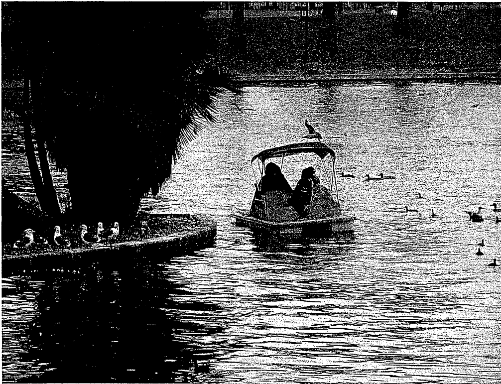
Figure 7. Photograph of a paddleboat being used for recreation.