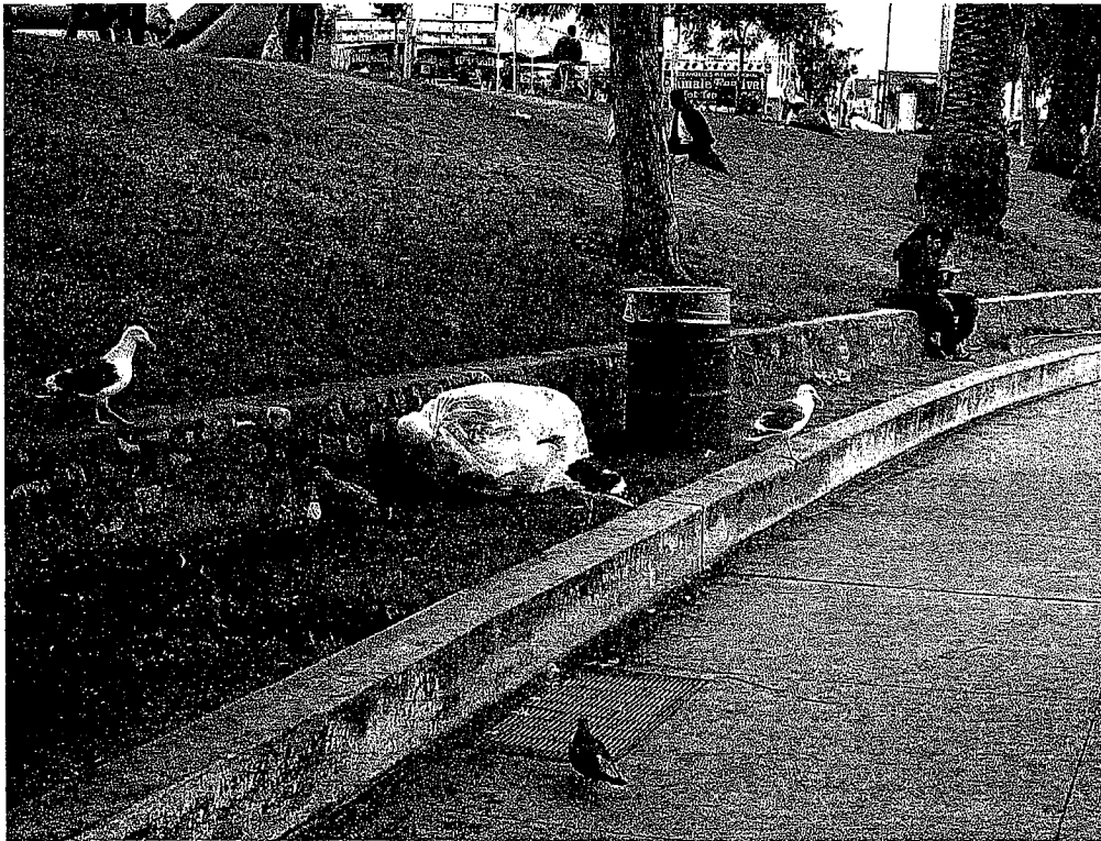
Figure 3. Photograph of open trash cans, bags of trash, and surrounding birds.