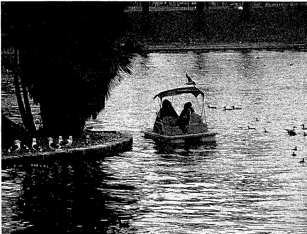
Figure 7. Photograph of a paddleboat being used for recreation.