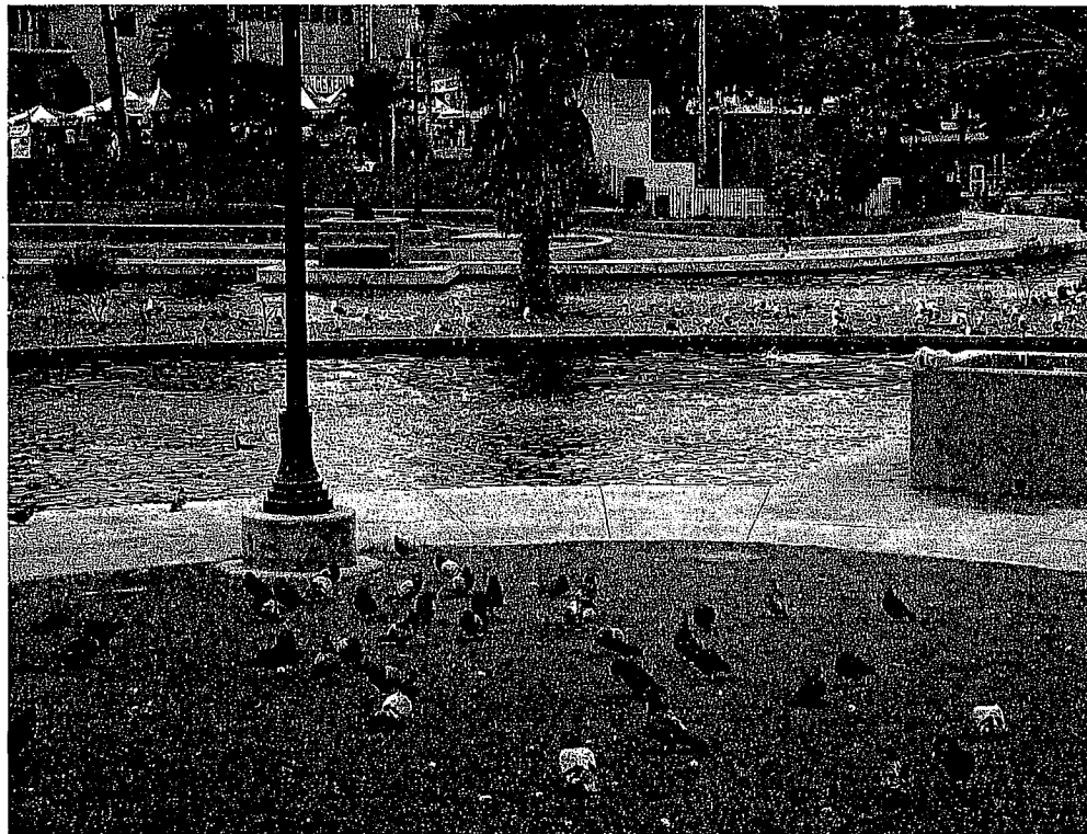
Figure 5. Photograph of pigeons in the foreground and ducks and gulls in the distance.