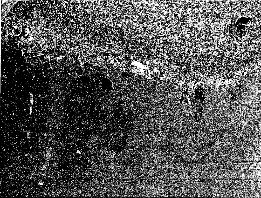
Figure 4. Photograph of trash and bird feathers floating on the water's surface near shore.