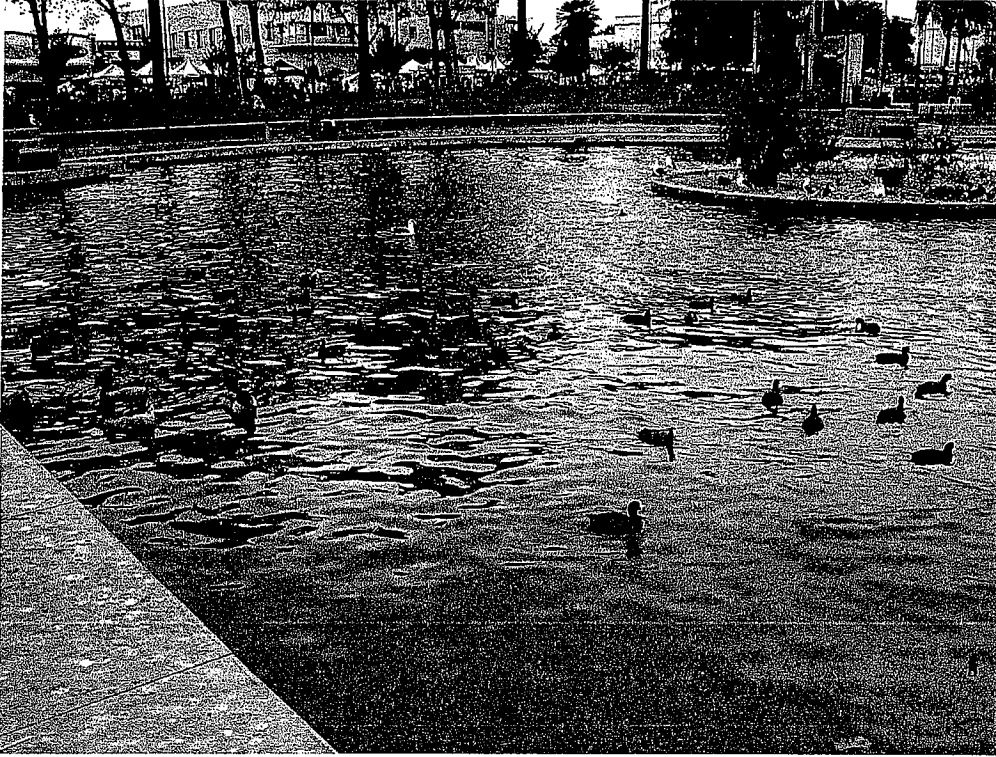
Figure 6. Photograph of various waterfowl in the lake with fecal matter along the cement shoreline in the foreground.