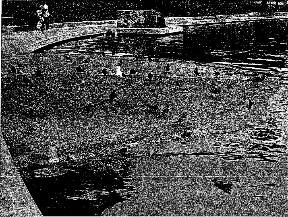
Figure 2. Photograph of the shoreline littered with trash and bird feces.