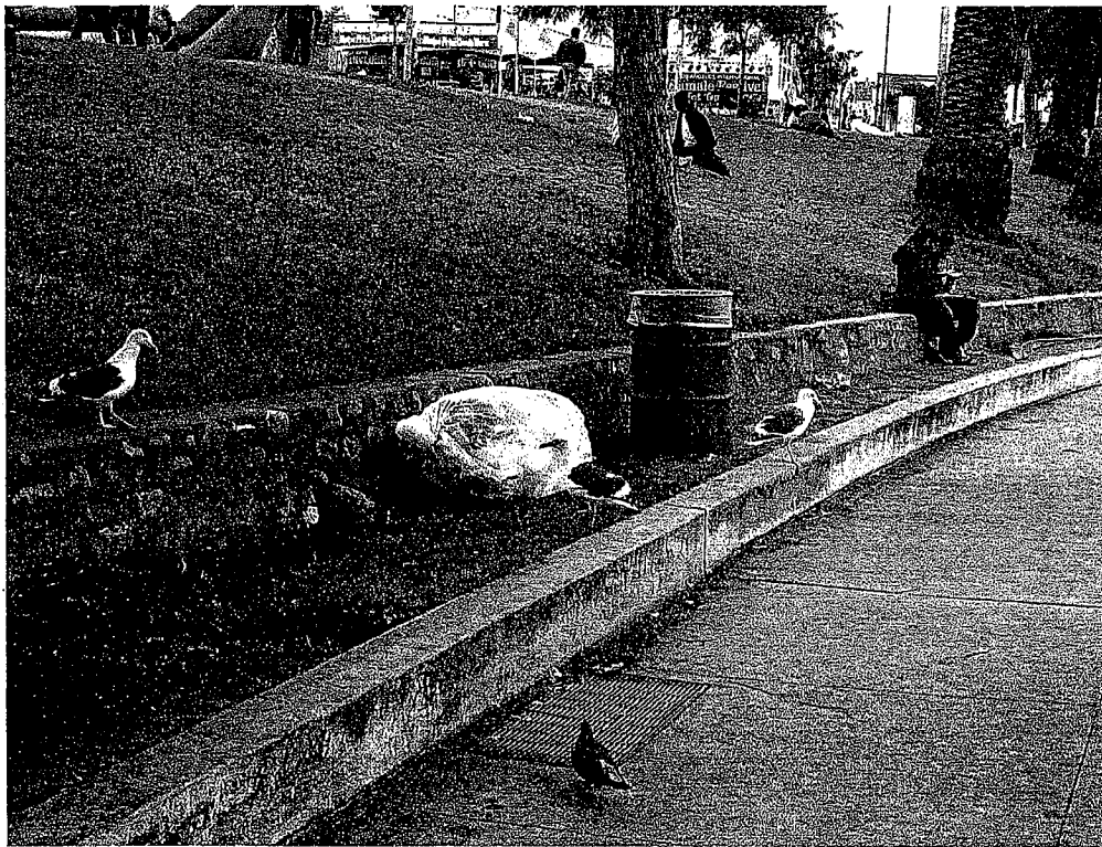
Figure 3. Photograph of open trash cans, bags of trash, and surrounding birds.