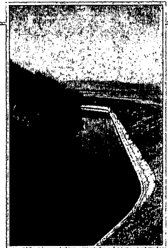
Contra Costa Canal

Delta, controls at the contamination sources or existing water treatment practices. After completion of the Sanitary Survey, the Los Vaqueros Reservoir was completed and filled. This reservoir provides another means of mitigation because water can be drawn from it when water can not be taken directly from the Delta.