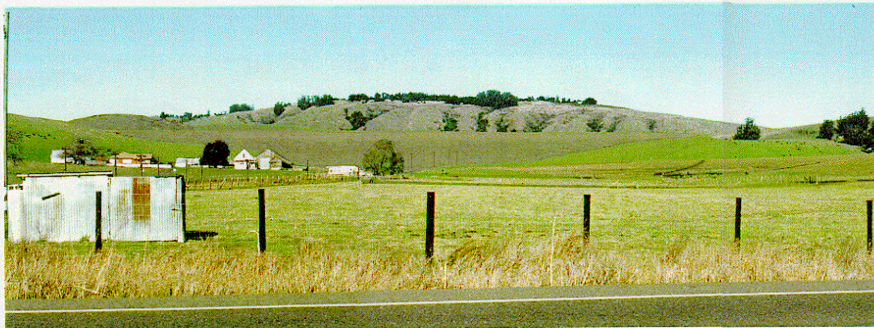
Computer model of dam one year after construction.