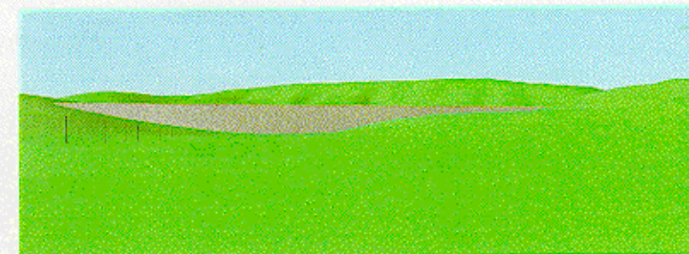
Computer model of dam