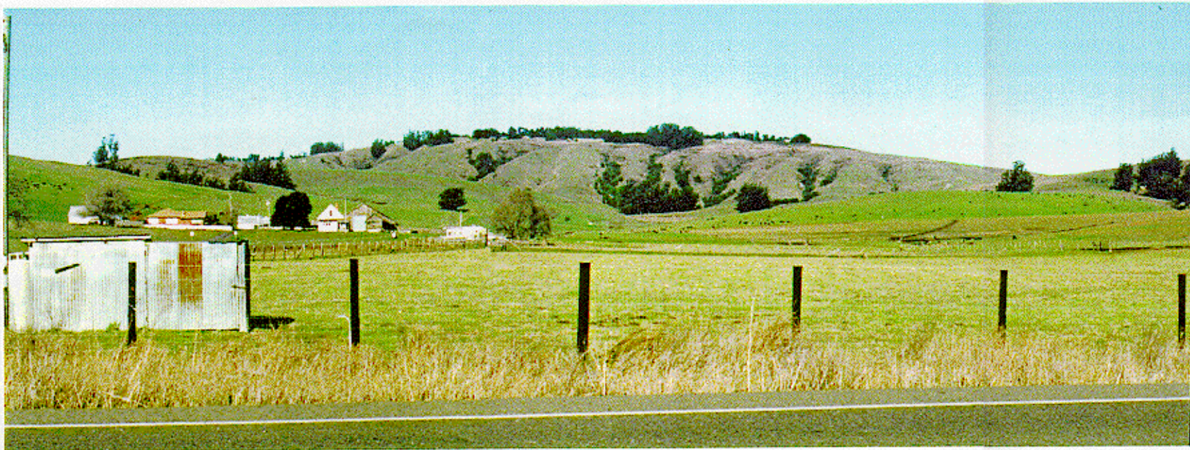
Existing view from Highway 1.