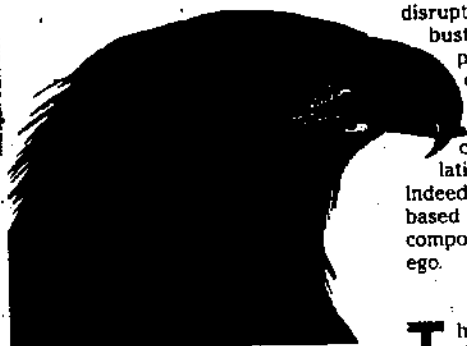
Juvenile bald eagle collected in Michigan last year. Its life-threatening bill deformity may have been caused by exposure to estrogenic chemicals.

"We've been seeing many more deformities in recent years," reports David Best, a bald-eagle specialist with the U.S. Fish and Wildlife Service in East Lansing, Mich. "We've also seen some suggestion of deformities in the embryos [of eggs that didn't hatch]," he notes. Hatching rates within this population also fall below those seen in less polluted areas, such as inland Alaska. Reproduction in these birds starts to fall when PCBs in their bodies exceed 4 to 6 parts per million (ppm) or DDE exceeds 1 ppm. "We're finding very much higher levels than that around the Great Lakes," Best notes — such as eggs with PCB concentrations as high as 120 ppm.