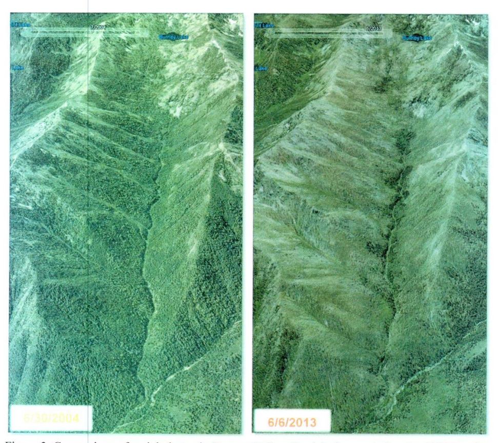
Figure 3. Comparison of aerial photos in Burney Valley Creek before and after the 2008 Panther fire, which burned at high severity across almost the entire watershed. Despite lower overall burn severity in the riparian zone than on middle/upper slopes, substantial portions of the riparian zone burned at high severity, likely directly affecting water temperature through reduced shade. The photos are draped over digital elevation model and tilted at an oblique angle using Google Earth. Area shown is approximately 1.5x3 miles.