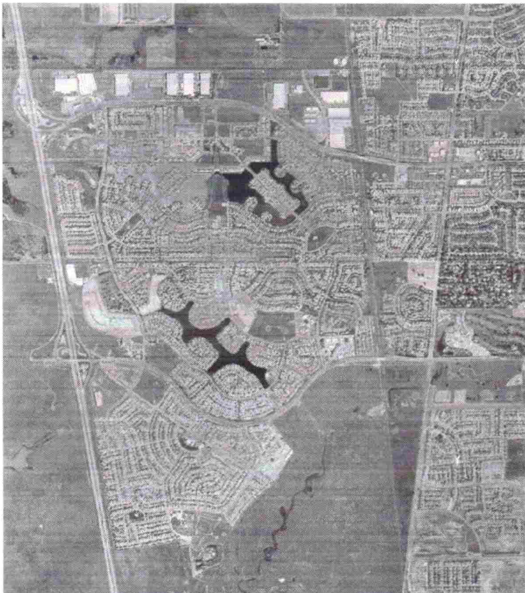
Subdivisions in Elk Grove, California, encroach on Stone Lakes NWR. The development below the curved road was built within the refuge acquisition boundary.

There are “glimmers of hope,” says Harvey, in the onslaught of development. Some area farmers who opposed establishing the refuge now appreciate its utility as a buffer between agricultural lands and urban encroachment. (One of the most vocal opponents subsequently sold his farmland to the refuge.) In fact, traditional farming practices on the lands around the refuge benefit species such as the Swainson's hawk, greater sandhill crane, and many other migratory birds. Still, Stone Lakes has its work cut out as development closes in on this key migratory and wildlife corridor.