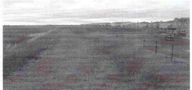
New housing development runs right up to the Stone Lakes NWR boundary. The land to the left of the road is the refuge.

Located in the San Joaquin-Sacramento Delta and the 100-year floodplain, the Stone Lakes NWR provides vital feeding and resting grounds for migratory birds on the Pacific Flyway and protects habitats that are rapidly disappearing in California's Central Valley: grasslands, wetlands, riparian, oak forest, and agricultural lands. In the 10 years since the refuge was established, nearby Sacramento and its surrounding counties have grown at staggering rates—up to 20 percent annually. As what was once open country around the refuge lands fills with tract houses and strip malls, Stone Lakes NWR is struggling to