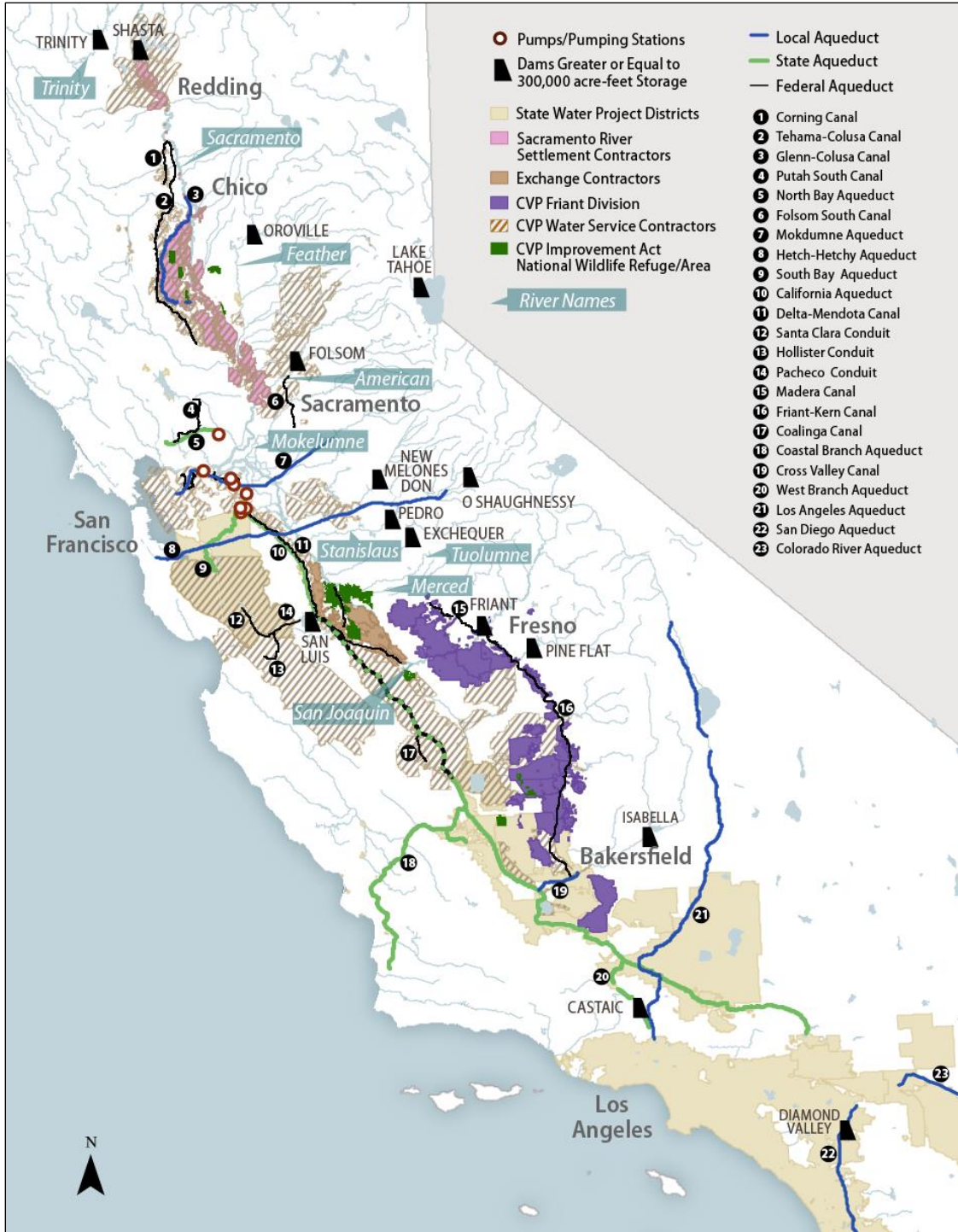
Figure I. Central Valley Project and Related Facilities