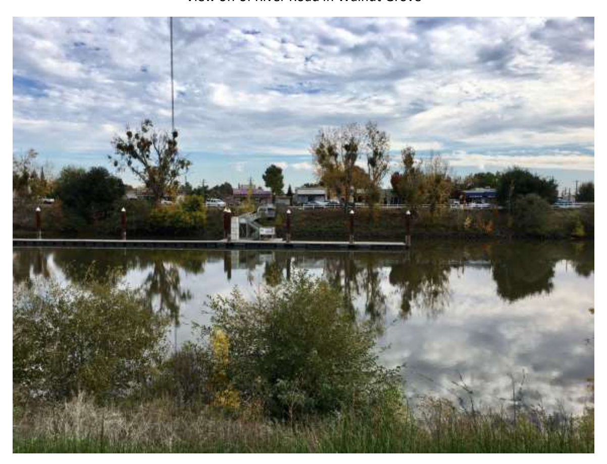
View off of River Road in Hood