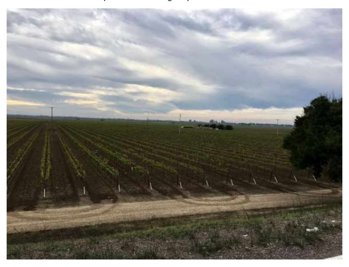
Winery off of Grand Island Road on Grand Island