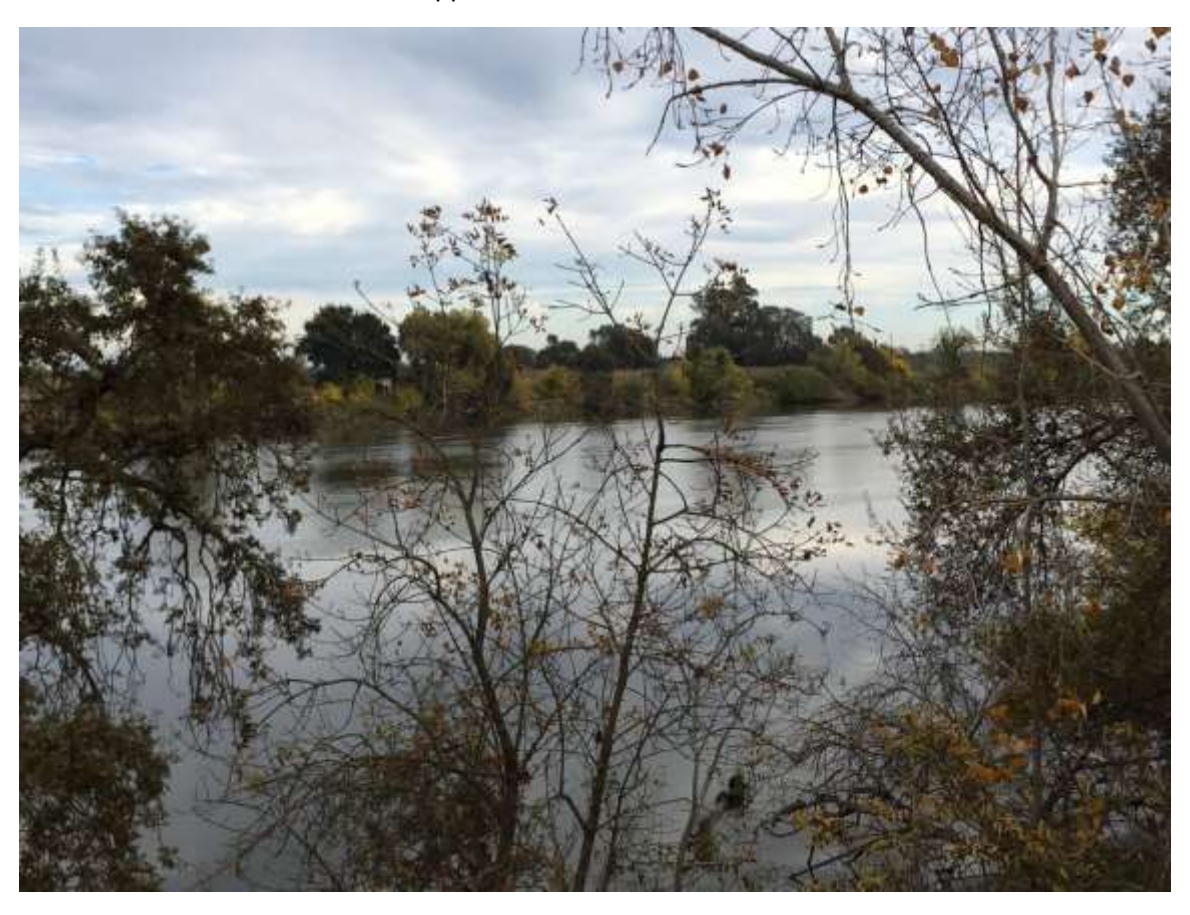
Approximate Site of Intake #3