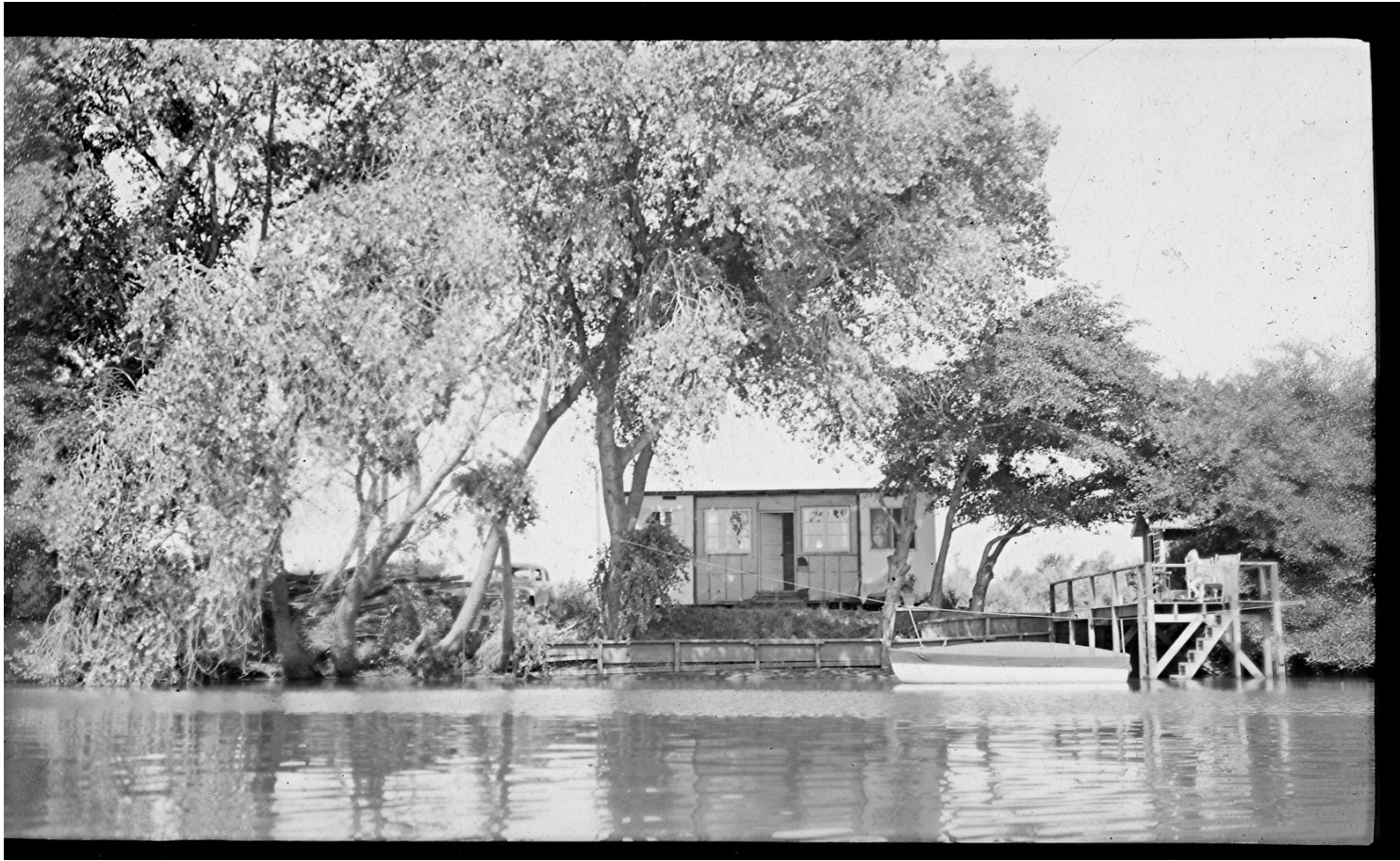
1940's fishing shack, fishing pier and dock at "Martin's Island" then renamed Snug Harbor