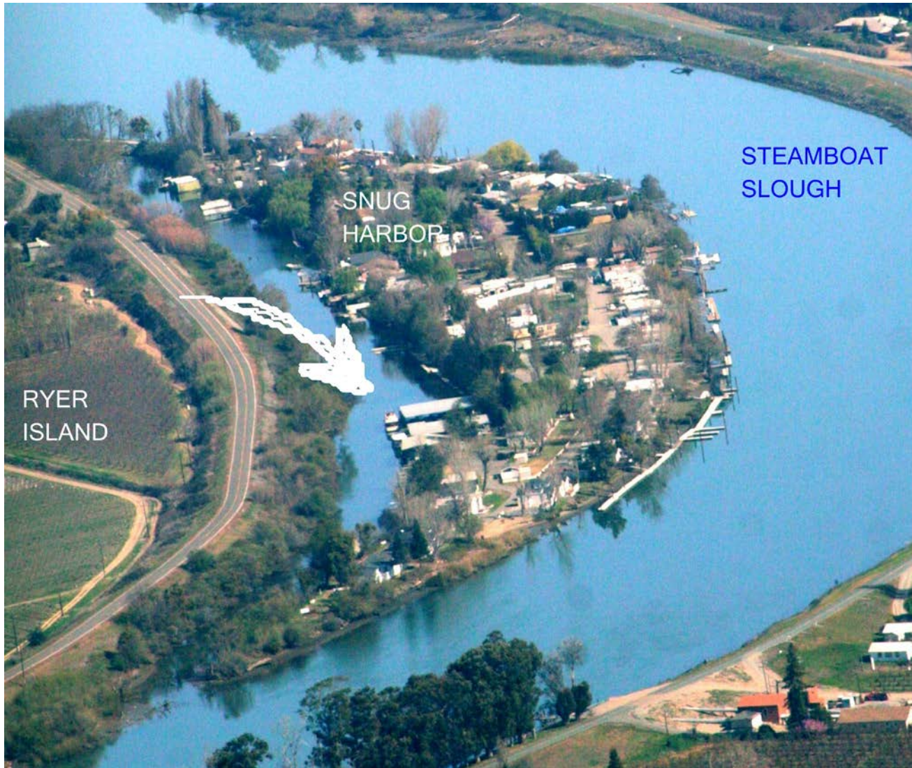
Snug Harbor peninsula with the cove shown with white arrow, approximately 2009