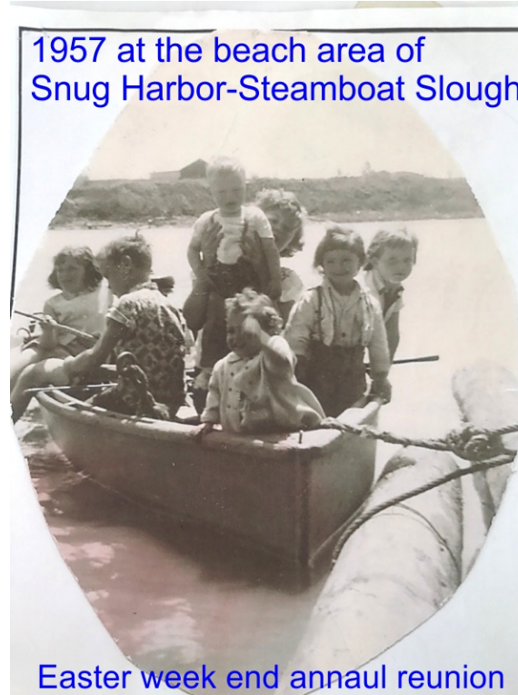
Easter week end annaul reunion