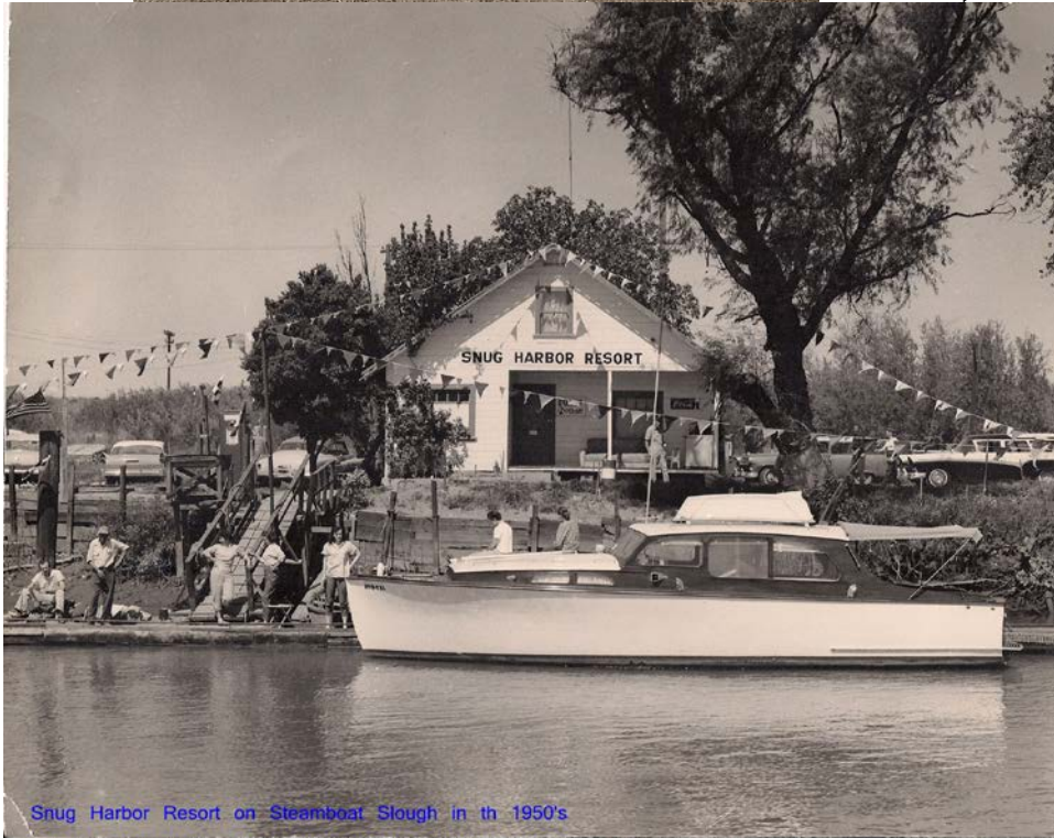
Snug Harbor Resort on Steamboat Slough in th 1950's