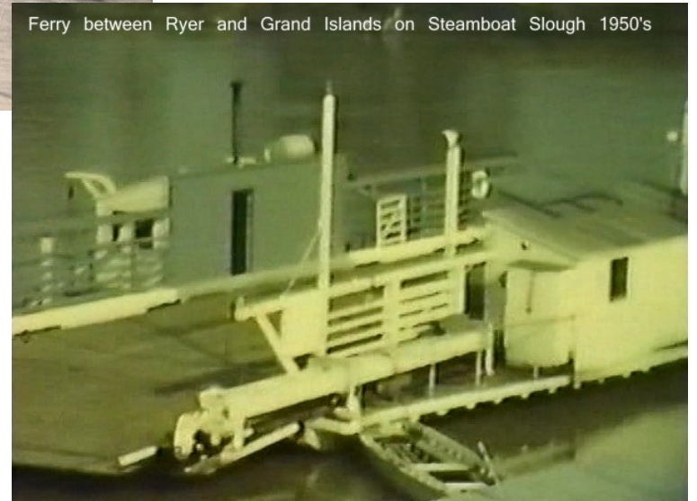
Ferry between Ryer and Grand Islands on Steamboat Slough 1950's