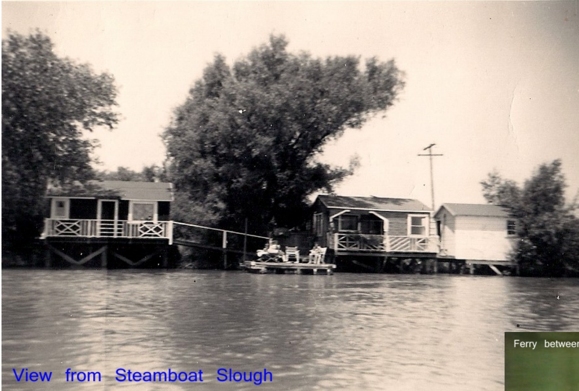
View from Steamboat Slough