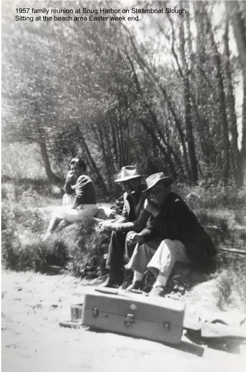
1957 family reunion at Snug Harbor on Steamboat Slough. Sitting at the beach area Easter week end.