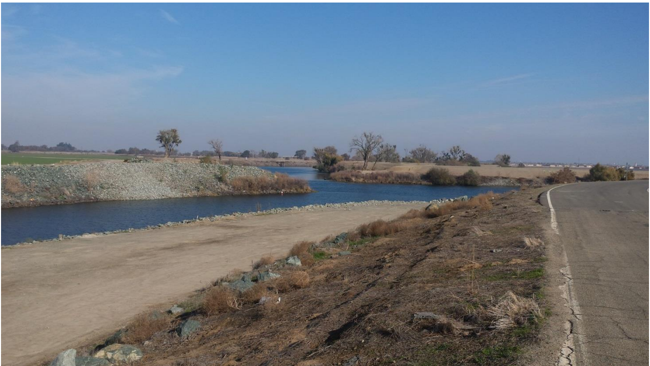
Photo 4.A.1-2. Looking NE across the barrier site, up Old River to the San Joaquin River. Dominant riparian habitat is non-native grassland.