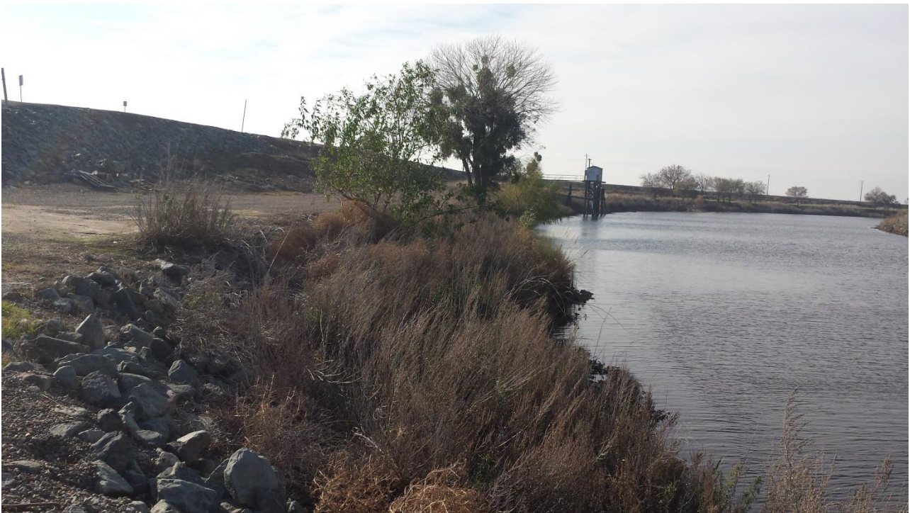
Photo 4.A.1-4. Looking west down Old River from the river bank. Dominant habitat is non-native grassland with small patches of Douglas sagewart. Trees onsite include small tobacco trees.