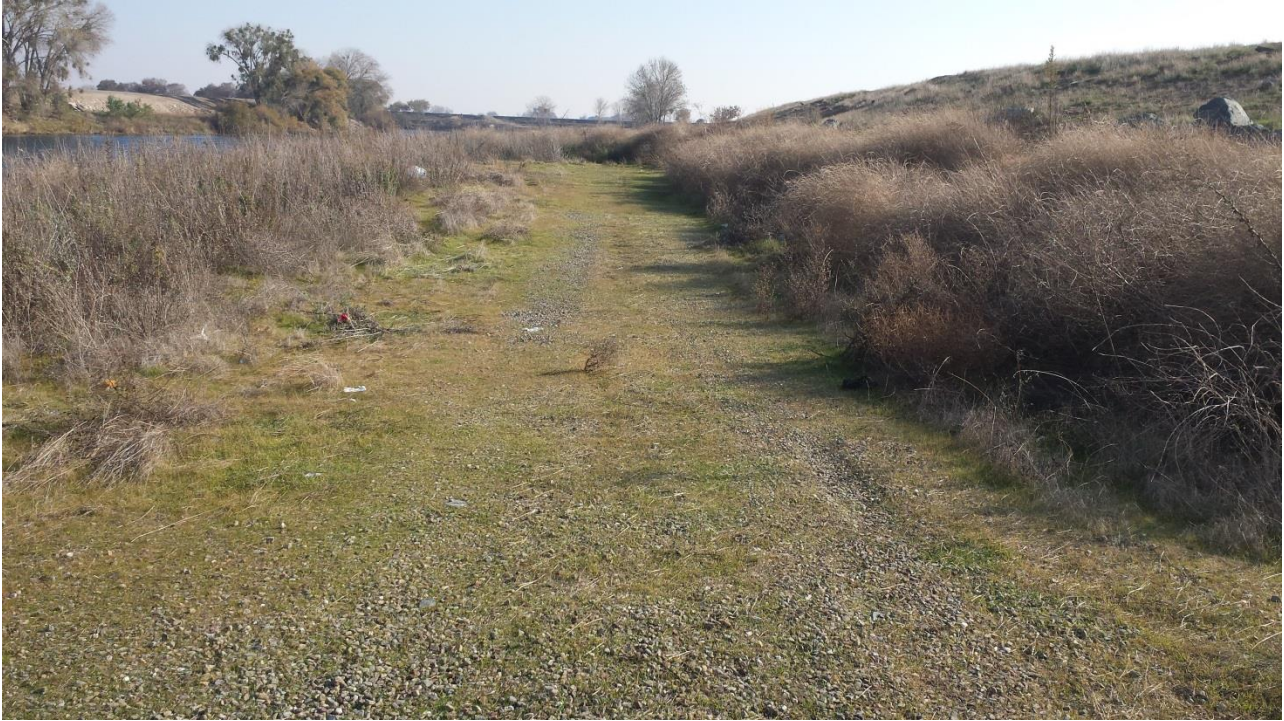
Photo 4.A.1-5. Looking SE down the lower bank shelf from the levee toe road (water-side). Dominant habitat is non-native grassland and Russian thistle with small, discontinuous patches of Douglas sagewart.