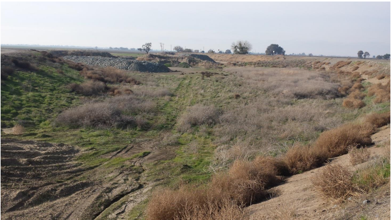
Photo 4.A.1-6. Looking west across the project staging area. Dominant habitat is non-native grassland and Russian thistle.