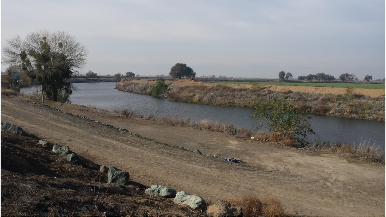
Photo 4.A.1-3. Looking west down Old River from the levee crown road. Dominant riparian habitat is non-native grassland. The few small trees onsite are tobacco.