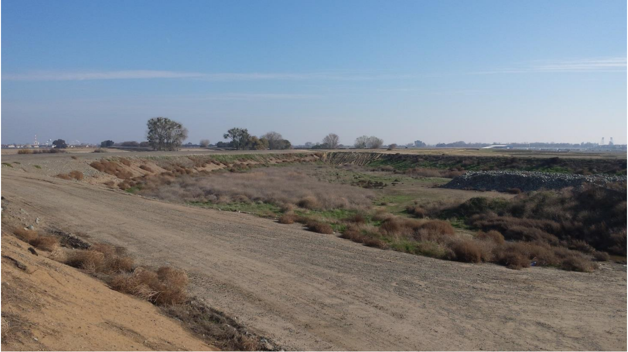
Photo 4.A.1-1. Looking SE across staging area. Dominant vegetation is non-native grassland and Russian thistle.