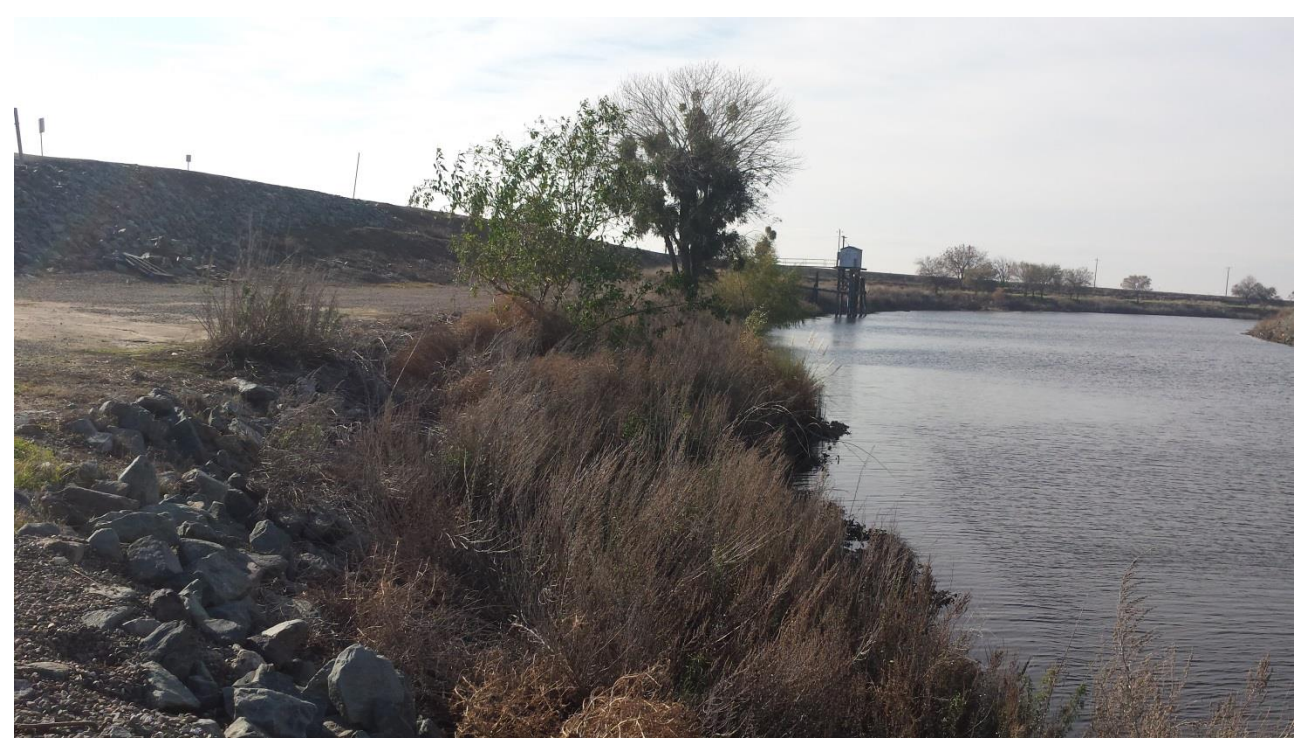
Photo 4.A.1-4. Looking west down Old River from the river bank. Dominant habitat is non-native grassland with small patches of Douglas sagewart. Trees onsite include small tobacco trees.