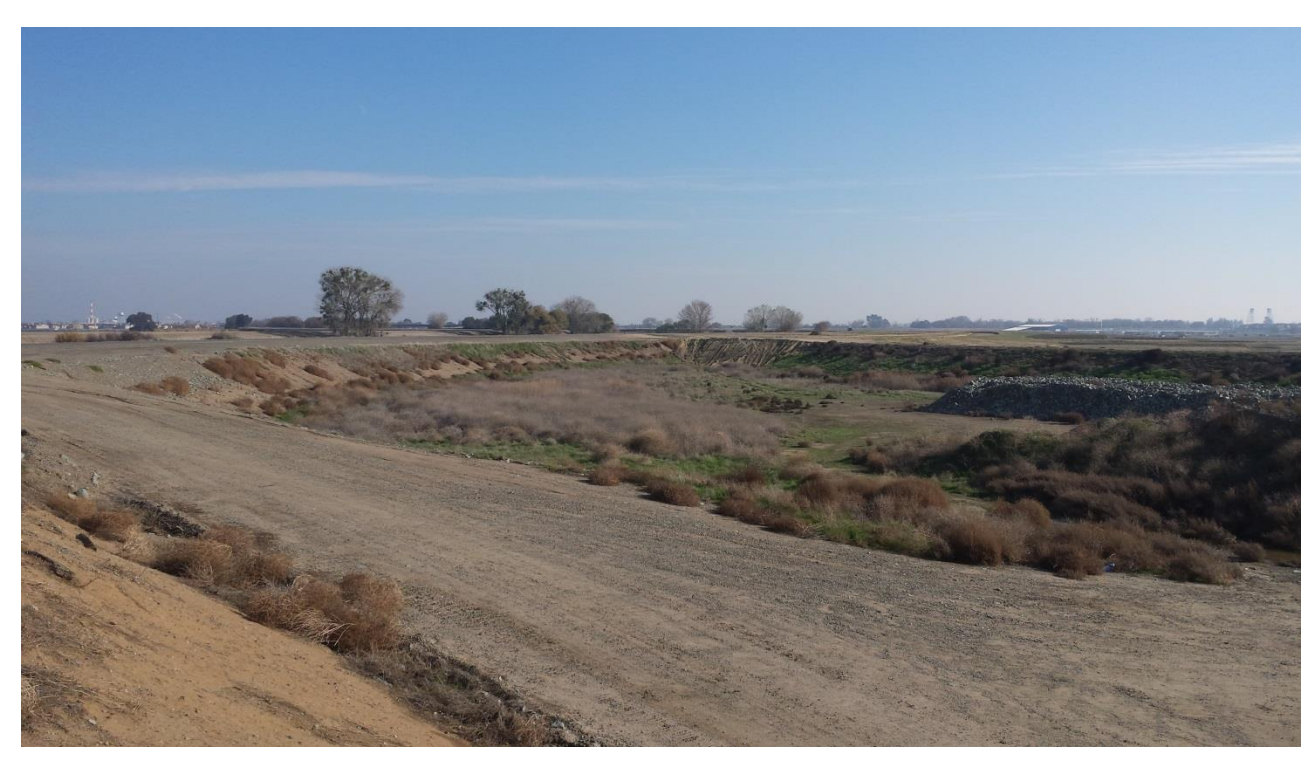
Photo\ 4.A.1-1.\ Looking\ SE\ across\ staging\ area.\ Dominant\ vegetation\ is\ non-native\ grassland\ and\ Russian\ thistle.