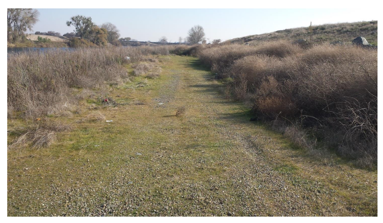
Photo 4.A.1-5. Looking SE down the lower bank shelf from the levee toe road (water-side). Dominant habitat is non-native grassland and Russian thistle with small, discontinuous patches of Douglas sagewart.