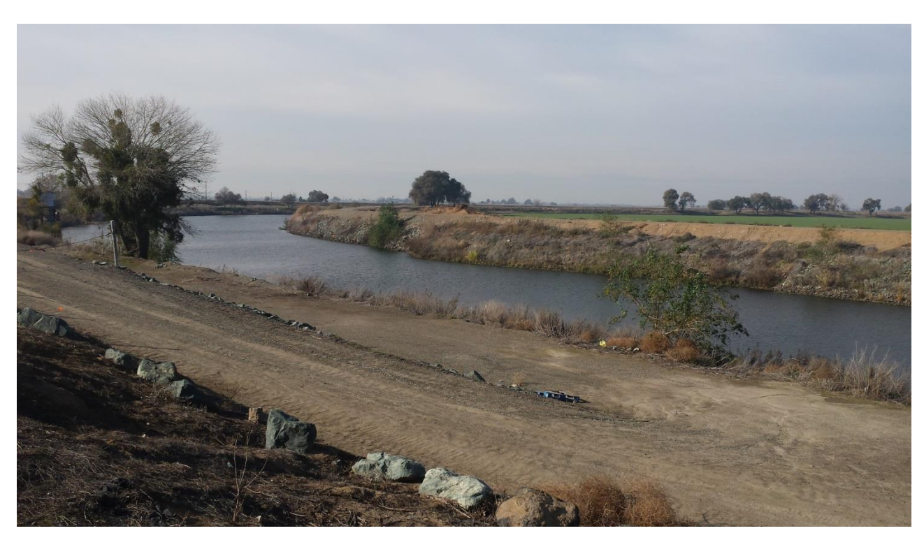
Photo 4.A.1-3. Looking west down Old River from the levee crown road. Dominant riparian habitat is non-native grassland. The few small trees onsite are tobacco.