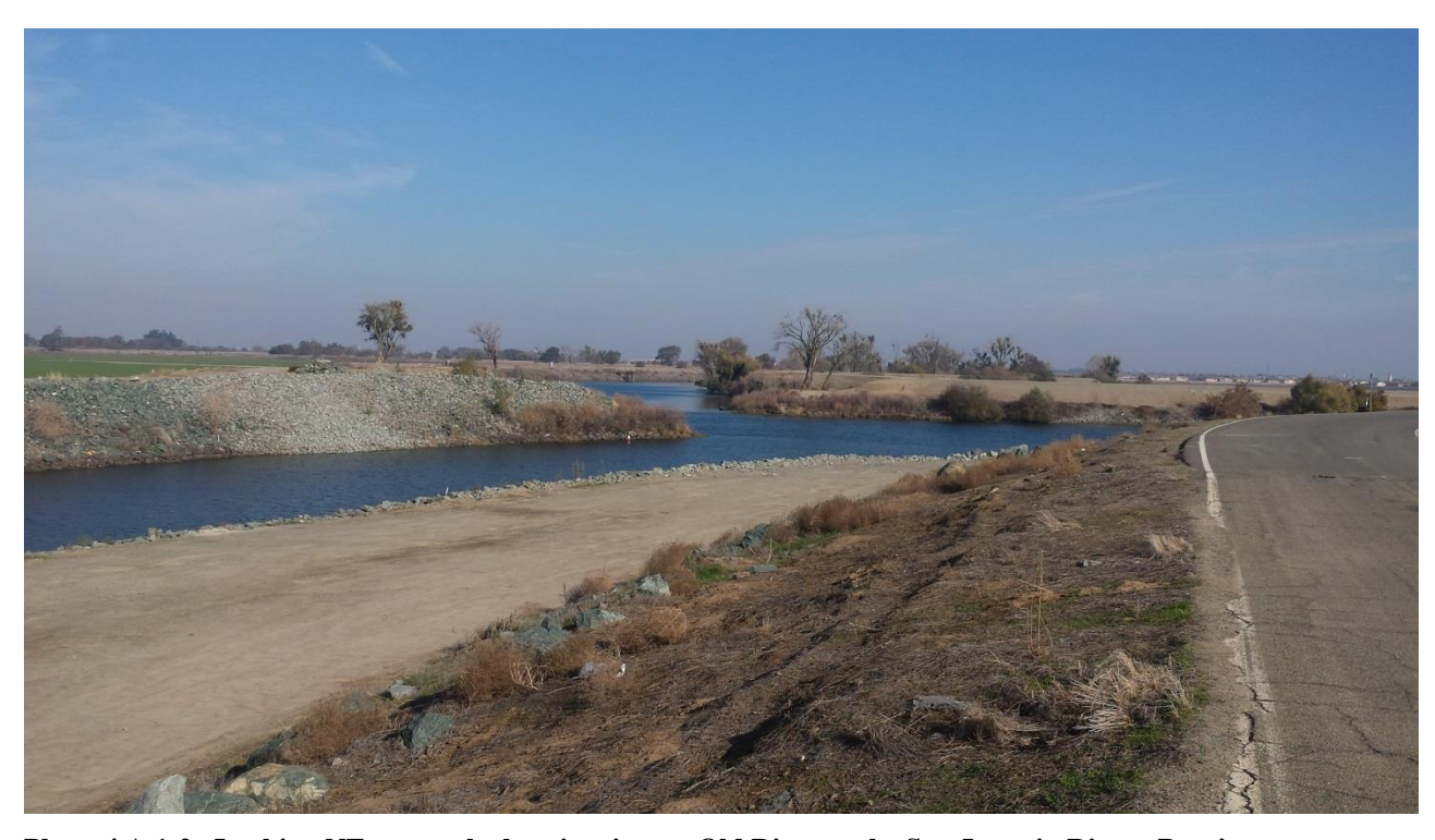
Photo 4.A.1-2. Looking NE across the barrier site, up Old River to the San Joaquin River. Dominant riparian habitat is non-native grassland.