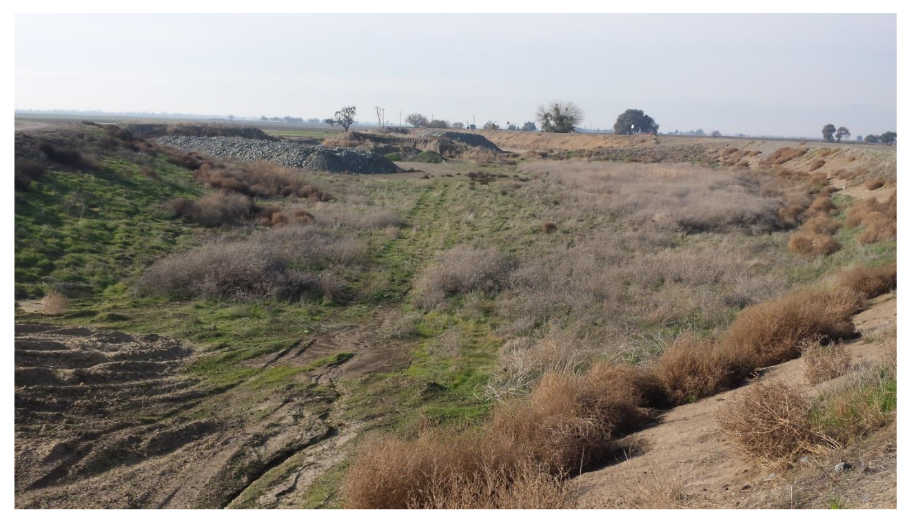
Photo 4.A.1-6. Looking west across the project staging area. Dominant habitat is non-native grassland and Russian thistle.