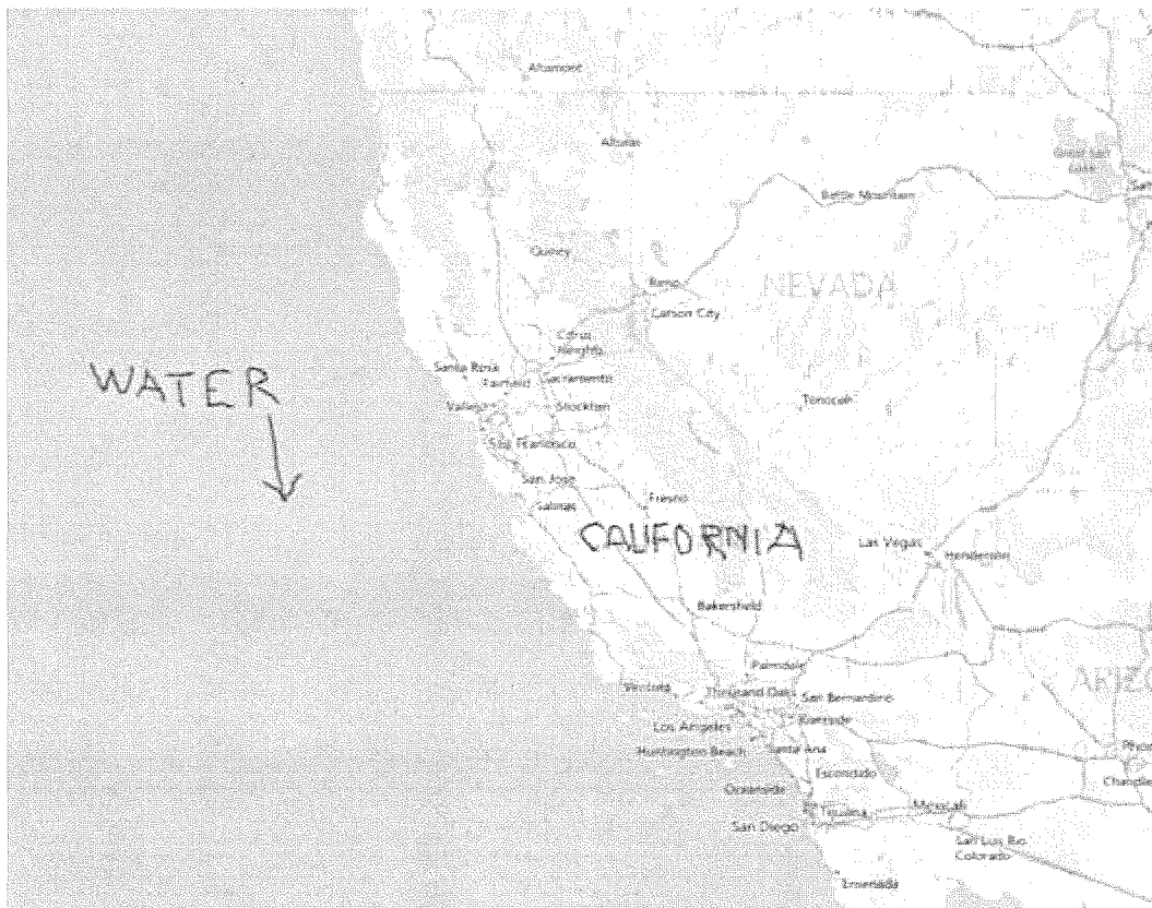
Location of the Pacific Ocean to the location of California which needs Water.