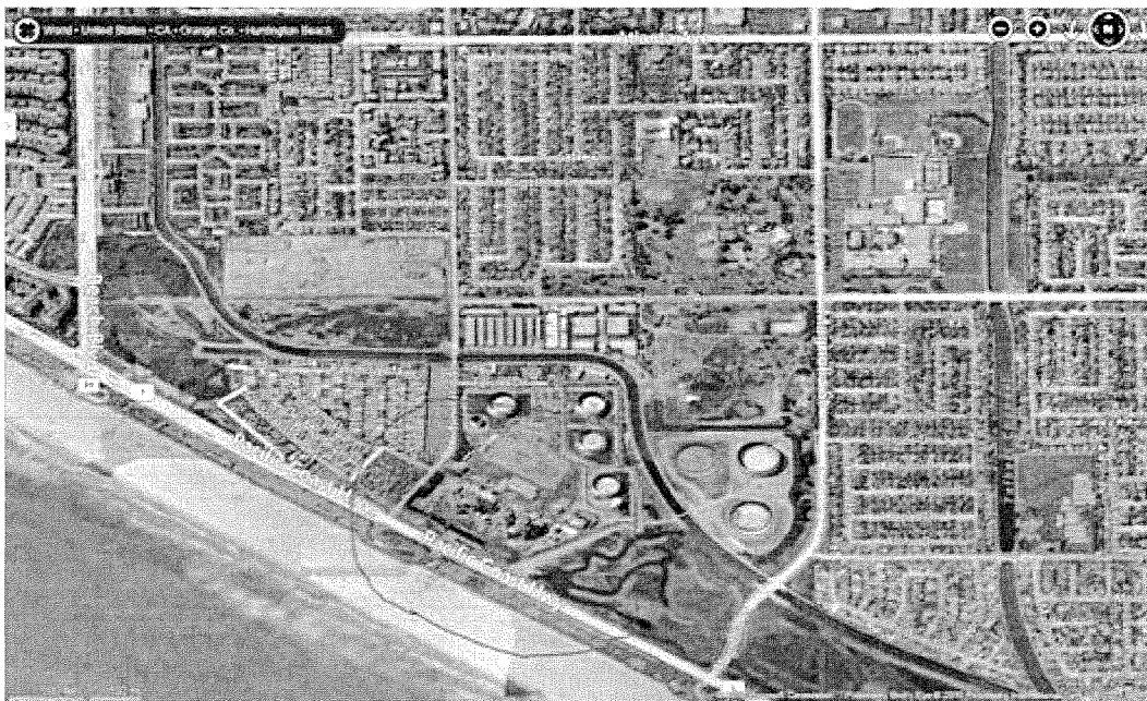
Huntington Beach, California Where the Edison Power Plants are that use desalination.