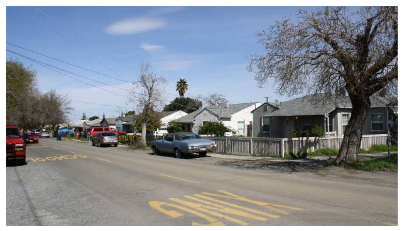
Figure 16B-4. A Residential Area of Bay Point