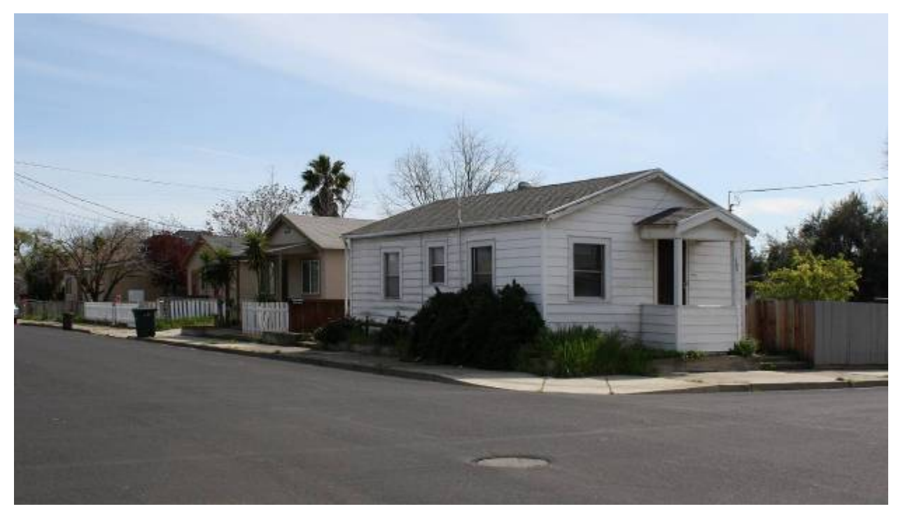
Figure 16B-8. Small Homes along a Side Street in Oakley