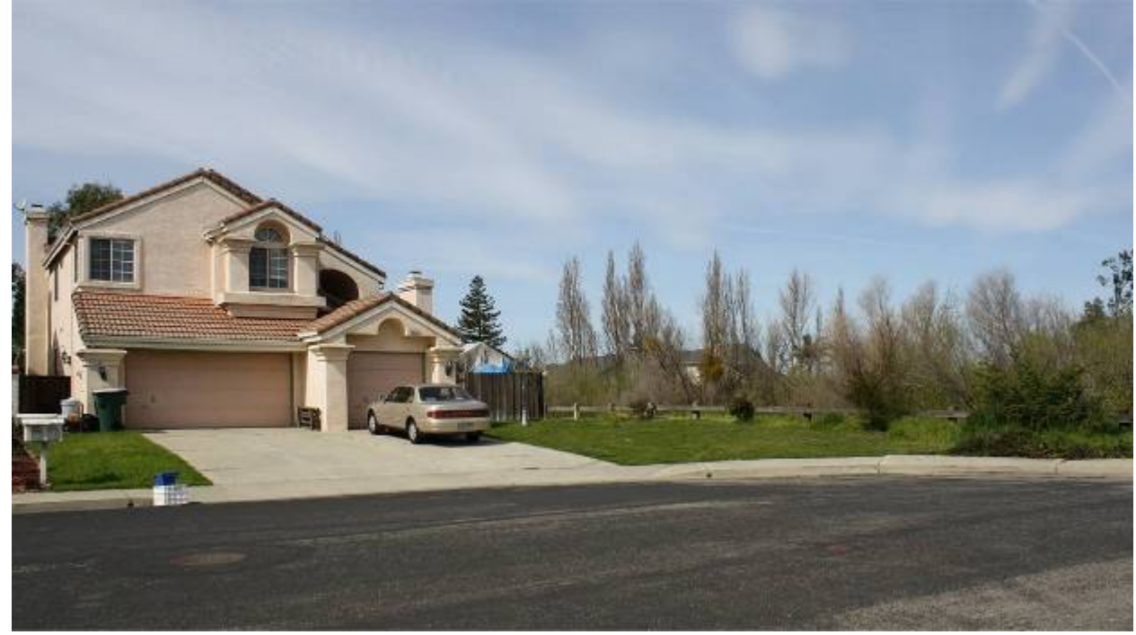
Figure 16B-9. A Residential Area near Big Break Regional Trail