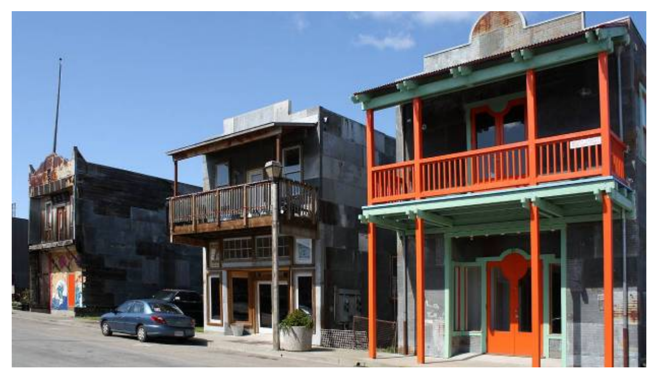
Figure 16B-18. Business Storefronts in the Historic Chinatown Section of Isleton