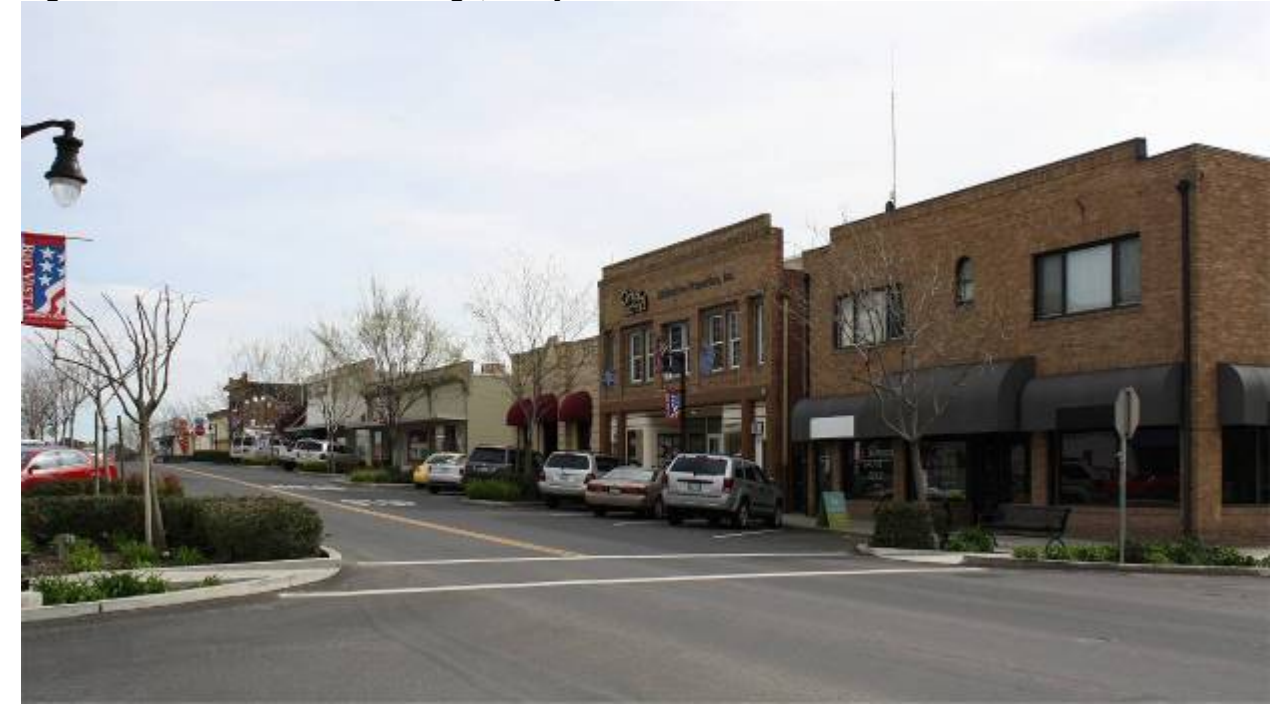
Figure 16B-25. Businesses in the Downtown Area of Rio Vista