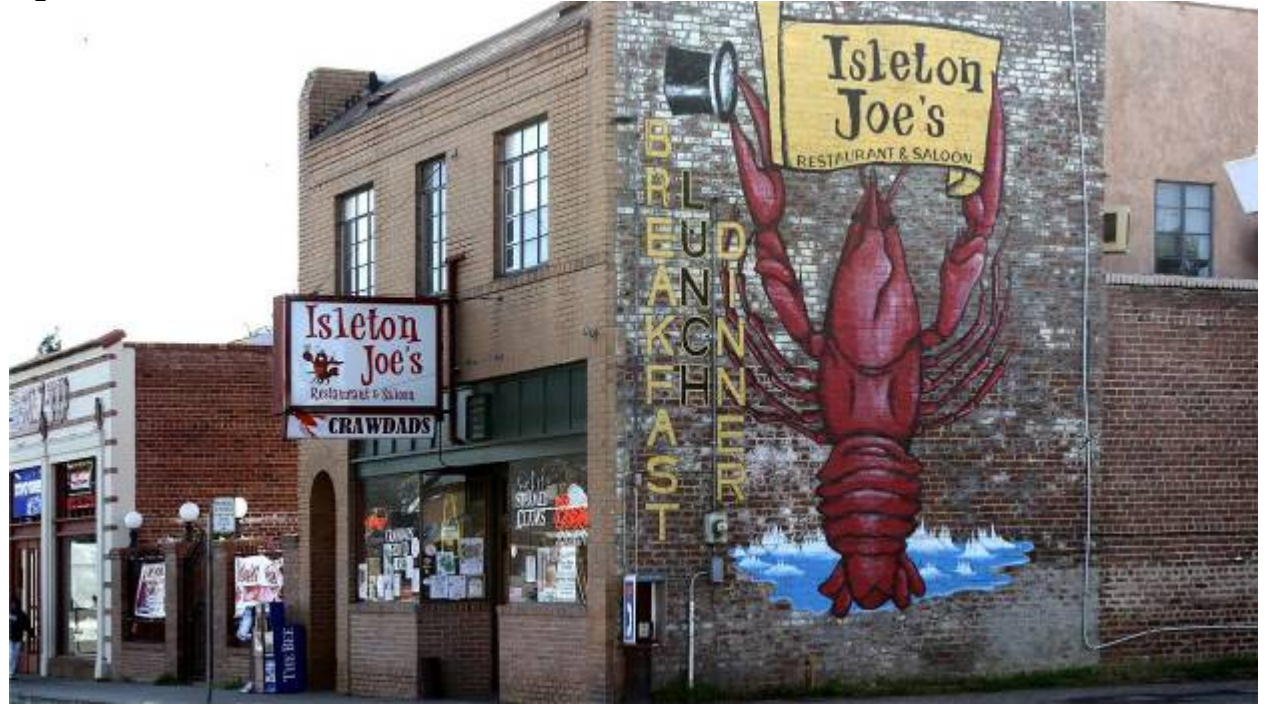
Figure 16B-19. A Local Restaurant in Isleton Featuring Crawdads

Figure 16B-18. Business Storefronts in the Historic Chinatown Section of Isleton