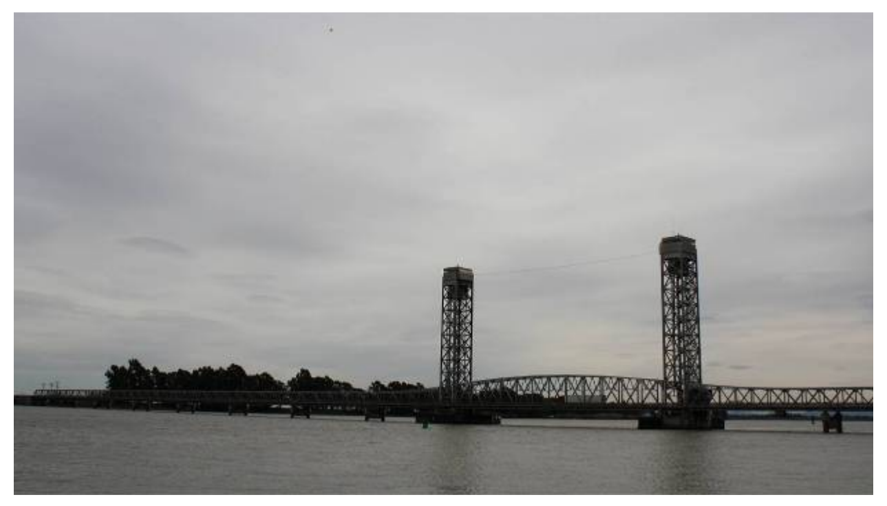
Figure 16B-24. Rio Vista Drawbridge, a Major Landmark in the Delta