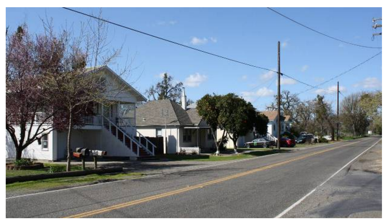
Figure 16B-14. Residences in Freeport along State Route 160