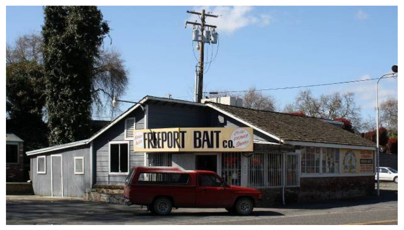
Figure 16B-16. A Bait Shop in Freeport