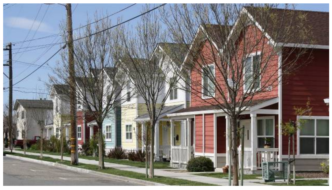
Figure 16B-2. A New Residential Development in Downtown Antioch