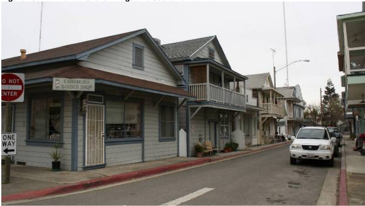
Figure 16B-22. Walnut Grove Bridge and Sacramento River

Figure 16B-23. Part of the Historic Japanese District of Walnut Grove