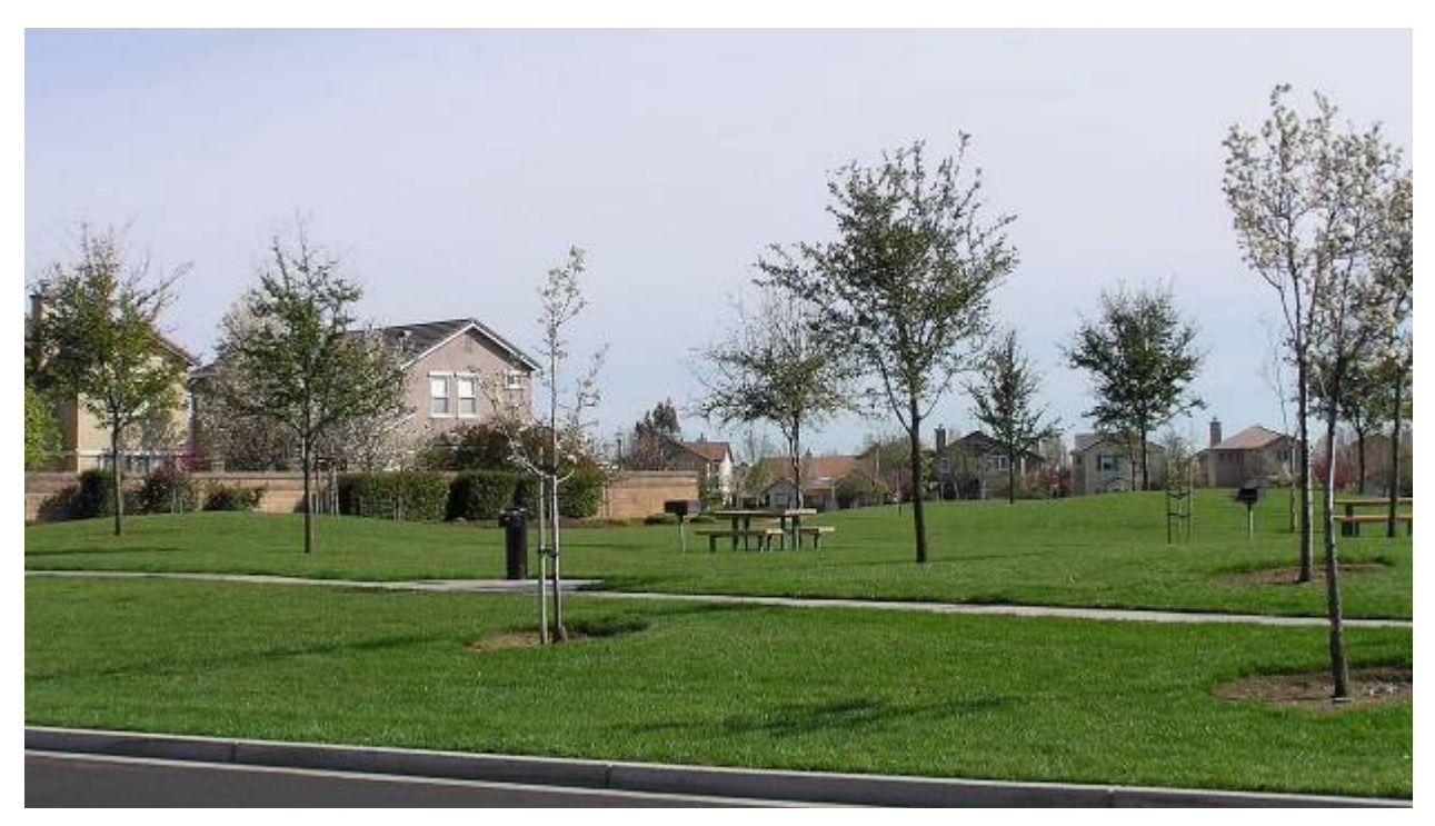
Figure 16B-6. An Open Space in Brentwood near a Residential Area