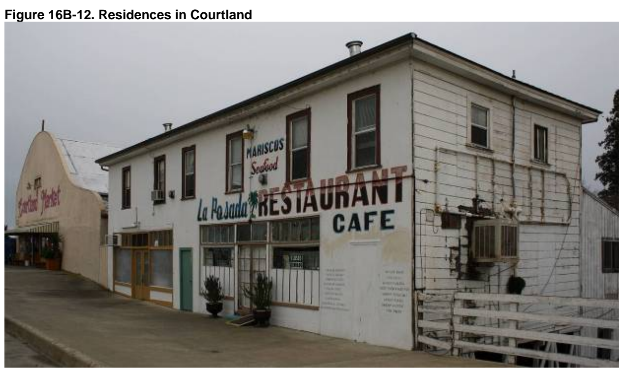
Figure 16B-13. Courtland Market and La Posada Restaurant along State Route 160