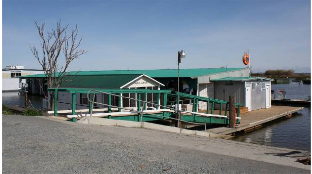
Figure 16B-5. A Gas Station and Diner for Boaters in Bethel Island

Figure 16B-4. A Residential Area of Bay Point