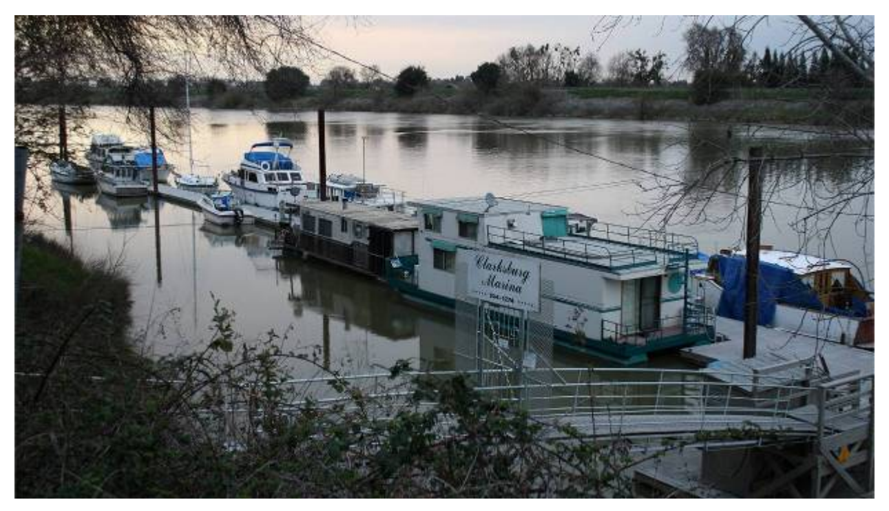
Figure 16B-26. Clarksburg Marina at Dusk