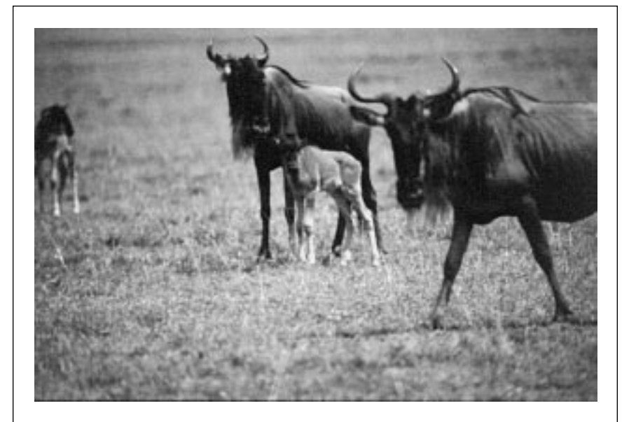
Figure 3. Each year more than 1 million wildebeest ( Connochaetes taurinus ) initiate their great migration along the Serengeti plains in search of fresh pastures, attracting millions of tourists from all over the world. Due to reduced patrols, poaching in the Serengeti National Park has increased over the last 20 years and ways for regulating exploitation are being considered.<sup>12</sup> How much harvest can be allowed without compromising the long-term persistence of the population?