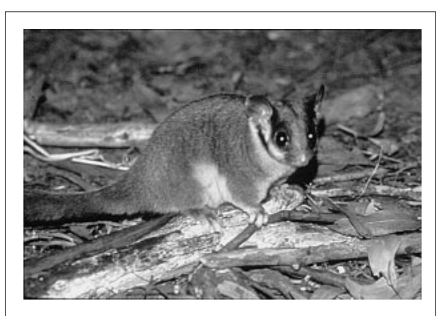
Figure 4. Leadbeater's possum is a small, rare marsupial now confined within the tall eucalyptus forests of Central Victoria, Australia. The loss of oldgrown forest due to catastrophic wildfires and logging has threatened this species with extinction. Permanent reservation of key forest patches appears to be the best strategy for conservation. But what would be the most effective reserve design given that there are constraints in the amount of area that can be set aside?

The prediction of an optimal reserve size is only a best guess. Using different parameters, the optimal size for Leadbeater's possum can range from 25 to more than 100 ha.<sup>14</sup> What if we are