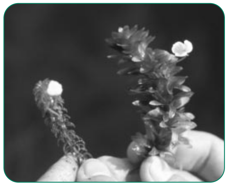
Figure 2. Egeria densa shoot-tip and flower. Note that only the male plants are present in the U.S.; therefore no seed production occurs in the Delta.

Bay/Delta. This of course has not prevented the invasion and establishment of many other exotic plants and animals that thrive in saline conditions! The Bay/Delta area is now home to over 200 invasive plant and animal species.