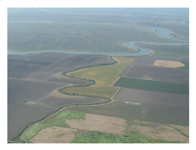
Figure 2. View of Delta today, where tidal wetlands been replaced by farmland and the rivers have confined channels. Note the sharp separation of aquatic and terrestrial habitats. Photo by P. Moyle, May 2009.

Francisco Estuary is one of the most highly modified and controlled estuaries in the world. The estuarine ecosystem has lost much of its former variability and complexity as indicated by major declines of many of its native fishes. Contributing to declines have been continual invasions of alien species and large changes in water quality from pollution and upstream diversions of fresh water.