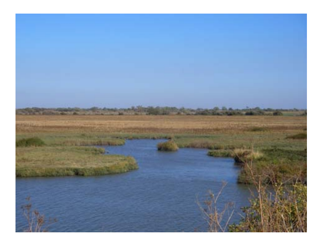
Figure 1. An idea of what much of the Delta looked like at one time comes from the recently reflooded Liberty Island, which has rapidly become a wetland with shallow tidal sloughs winding through patches of tules and other emergent plants. Photo by P. Moyle, September, 2008.

Such abundance implies high productivity, which was likely generated by nutrients from the extensive riparian corridors, marshes and seasonal floodplains. High connectivity among the habitats allowed the dispersion of these nutrients throughout the system and into the estuarine food webs, supporting the dense fish populations. These elements formed the key conditions for the historical estuary to function as a center of biotic abundance and diversity in central California. The arrival of Euro-Americans in Central California changed all that. In this essay, we discuss the series of major ecological changes that led to the present Delta and to the likely next ecosystem shift. We then provide some principles upon which to manage flows to try to direct change, rather than to just react to it.