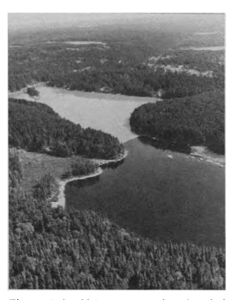
Fig. 1. Lake 226, demonstrating the vital role of phosphorus in eutrophication. The far basin, fertilized with phosphorus, nitrogen, and carbon, was covered by an algal bloom within 2 months. No increases in algae or species changes were observed in the near basin, which received similar quantities of nitrogen and carbon but no phosphorus.

In an early experiment, phosphate and nitrate were added to lake 227,