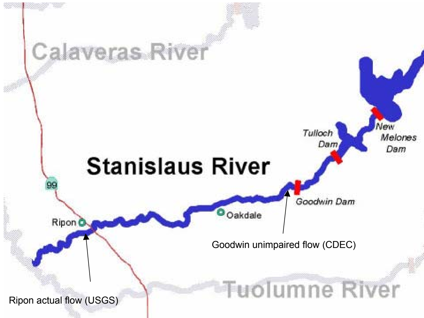
Figure 4. Map of the Stanislaus River showing the location of the flow gauging stations.