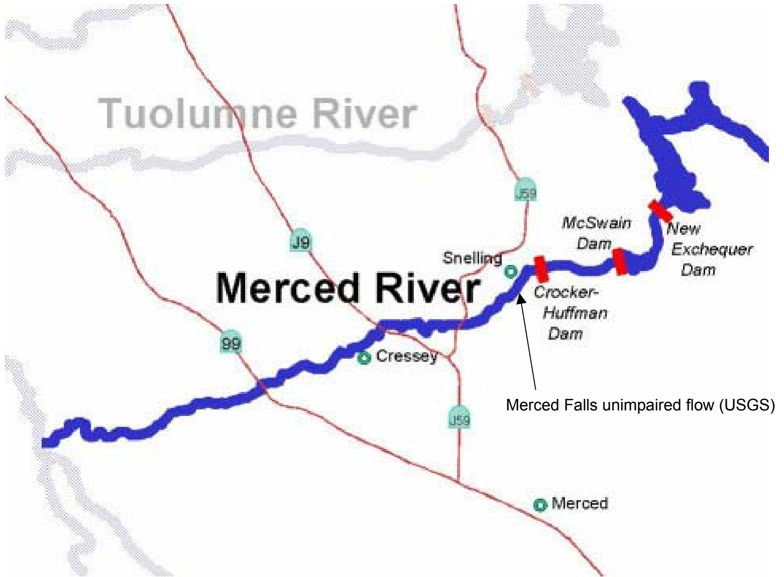
Figure 6. Map of the Merced River showing the location of the flow gauging stations.