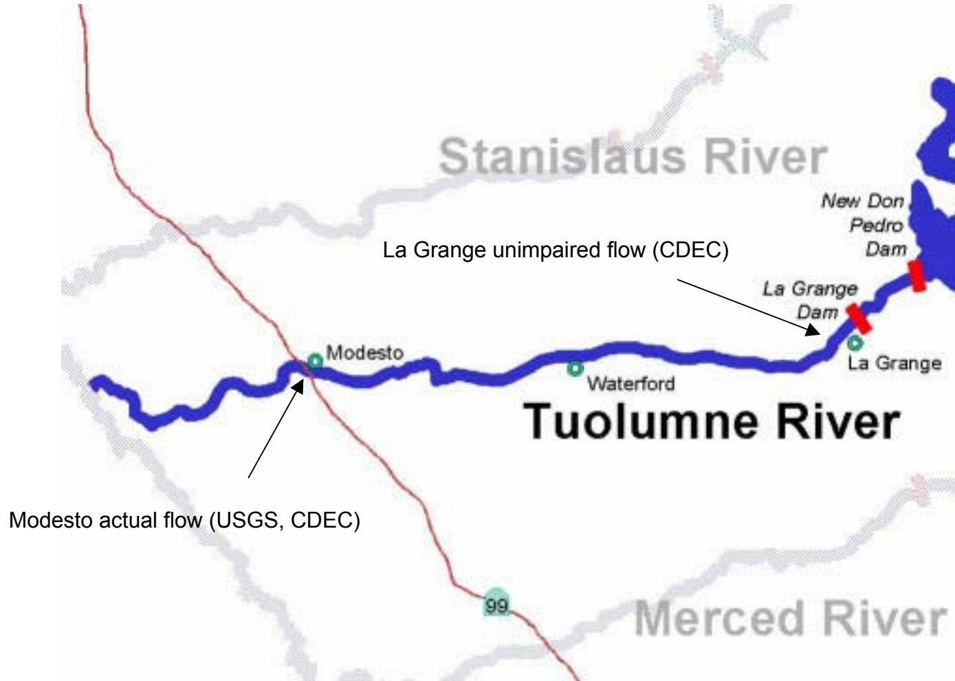
Figure 5. Map of the Tuolumne River showing the location of the flow gauging stations.