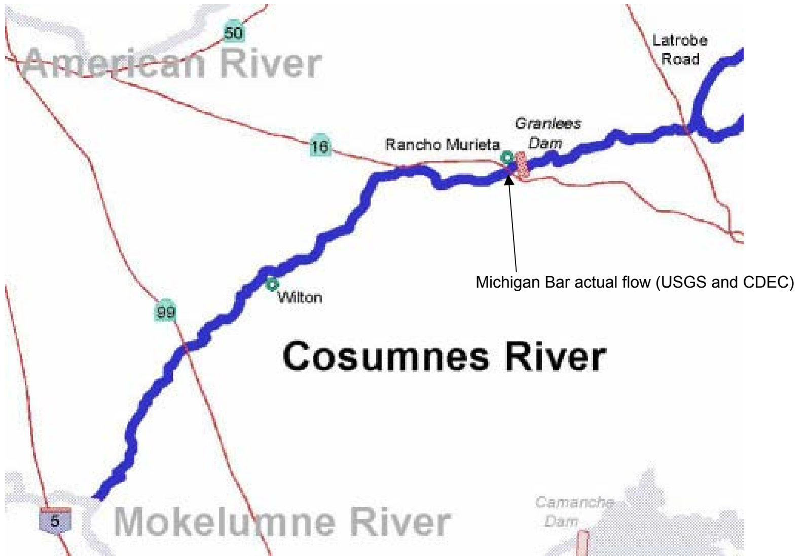
Figure 2. Map of the Cosumnes River showing the location of the flow gauging stations.