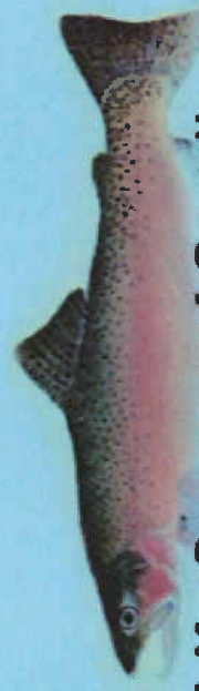
Life Stages of Steelhead