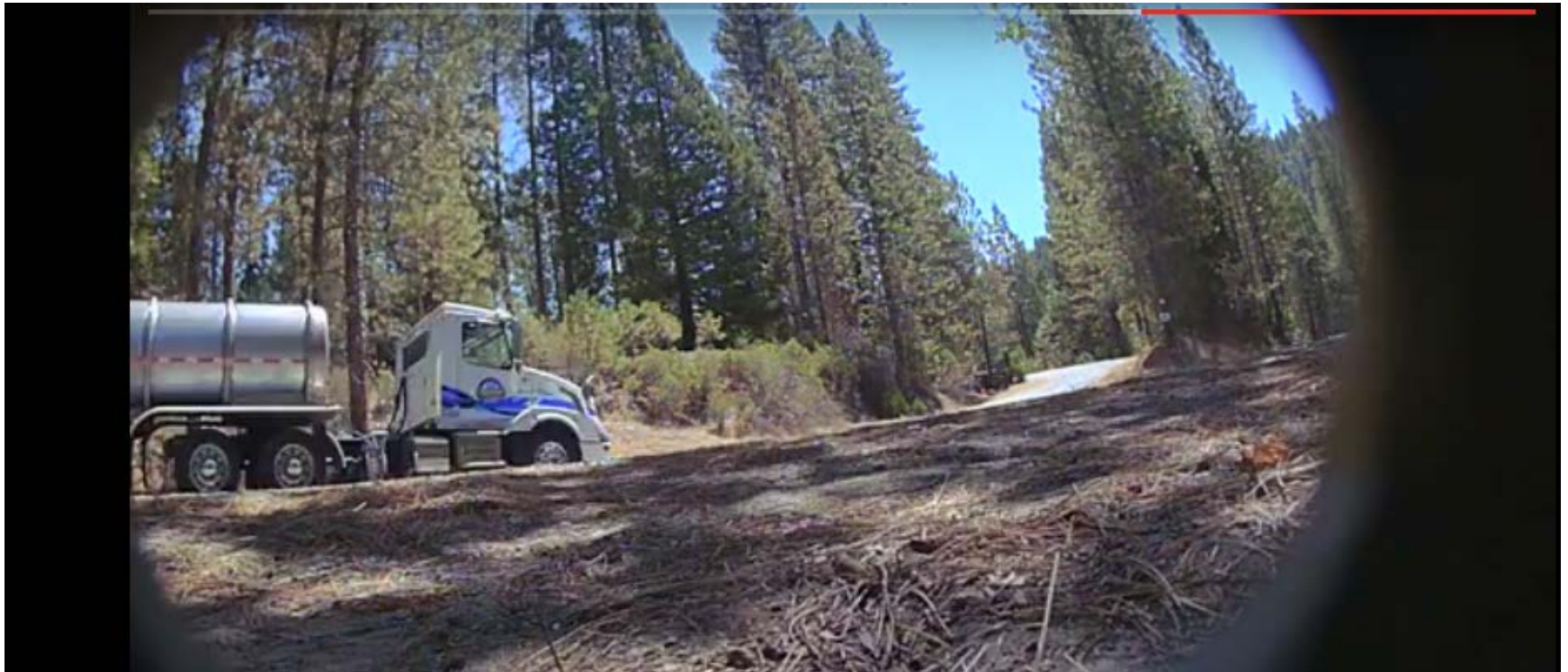
Water truck entering Transfer station on August 12, 2015. (captured on the Fake Rock Cam, at 12:13 PM)