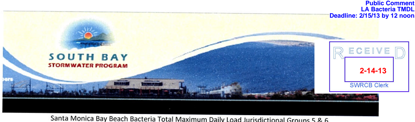
Santa Monica Bay Beach Bacteria Total Maximum Daily Load Jurisdictional Groups 5 & 6El SegundoManhattan BeachHermosa BeachRedondo Beach