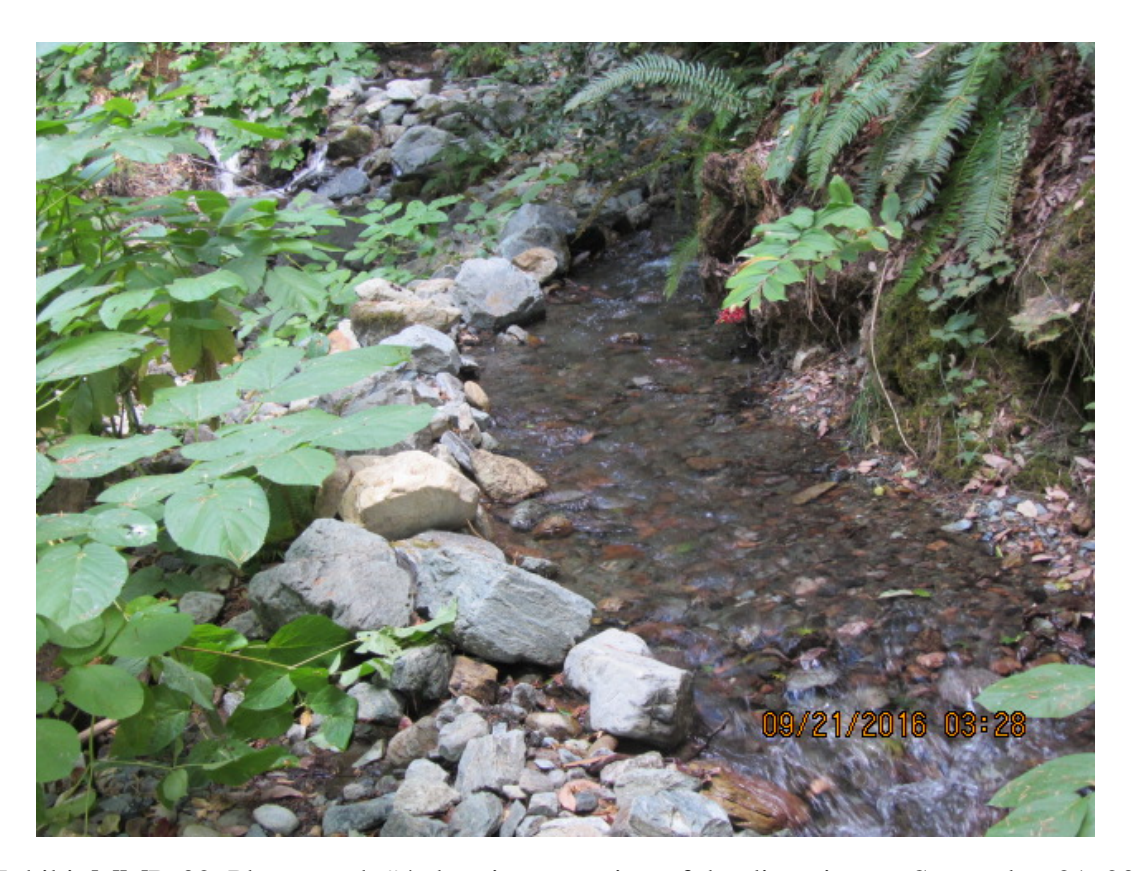
Exhibit MMR-02, Photograph #4 showing a portion of the diversion on September 21, 2016