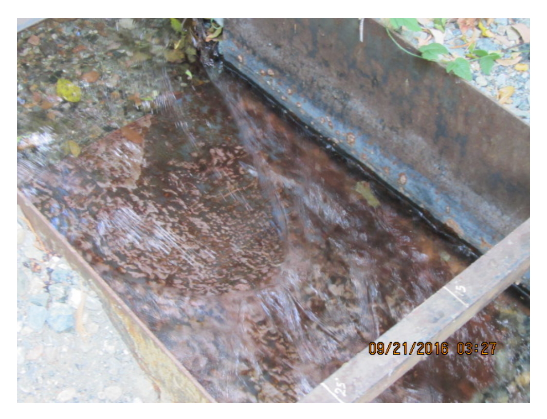
Exhibit MMR-02, Photograph #6 showing a culverted portion of the diversion on September 21, 2016

The additional photographs included in this Exhibit MMR-02 was part of the 20 November 2013, Marble Mountain Ranch Water Rights Investigation Report prepared by Cascade Stream Solutions, LLC