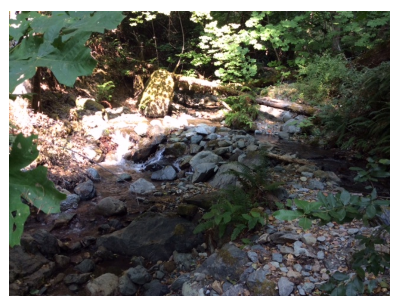
Exhibit MMR-02 Photograph #1 – The point of diversion at Stanshaw Creek with rock dam during a period of lower flows in late summer 2016