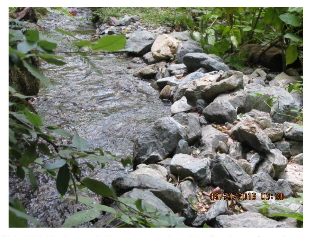
Exhibit MMR-02, Photograph #3 showing a portion of the diversion on September 21, 2016