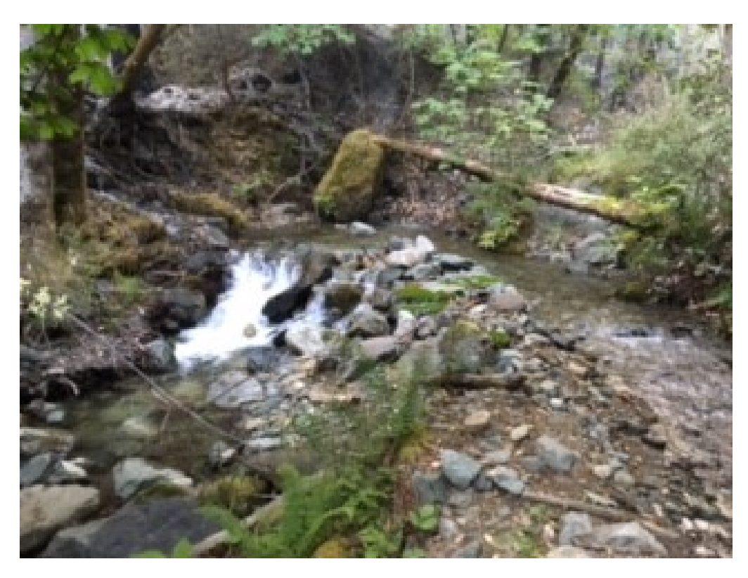
Exhibit MMR-02 Photograph #2 – The point of diversion at Stanshaw Creek with rock dam during a July 2017 fire event