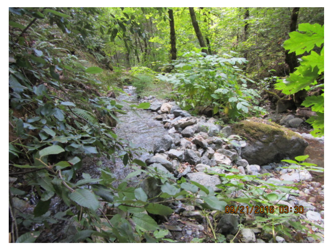
Exhibit MMR-02, Photograph #5 showing a portion of the diversion on September 21, 2016