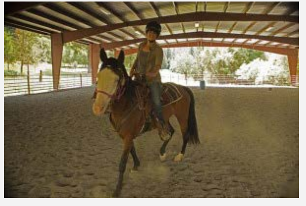
Horse Riders In A Covered Arena

1. Students feel more secure and willing to push the envelope in a more sheltered setting. They are more willing to move to the "next level" when there is a sense of more managed riding risk.