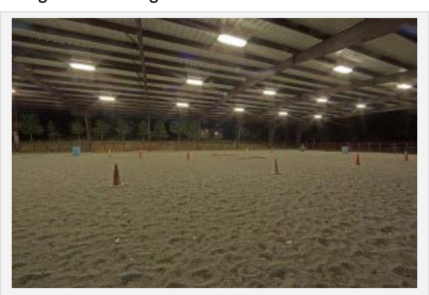
Indoor Arenas with overhead lighting allows night-time riding