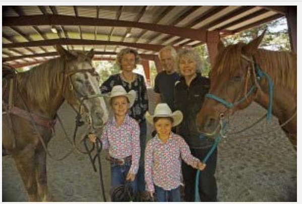
Grandparents, Parents, and children all gain from riding in a covered arena

the rider, and passively participate through the observation of a riding lesson.