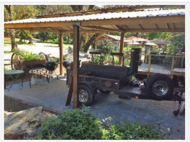
Nearly complete BBQ depot at California's Guest Ranch

For example, this year our dream of building a "BBQ Depot" for the ranch is coming to fruition. We are building a beautiful covered outdoor kitchen with a Texas built "Klose" meat smoker, a Santa Maria Grill, and an attached hors d'oeuvres area.