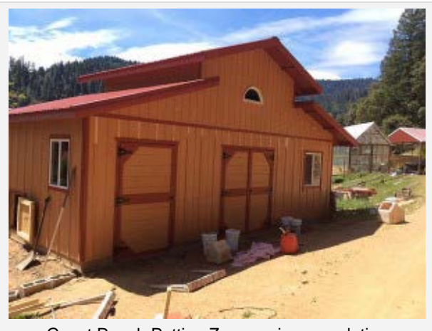
Guest Ranch Petting Zoo nearing completion

We feel firmly that the day we stop dreaming about the next improvement, upgrade, and service addition, is the day we need to get out of the guest ranch industry- or get out of Dodge as a cowboy would say. If we are static, we are dying. So, we dream it, and build it.