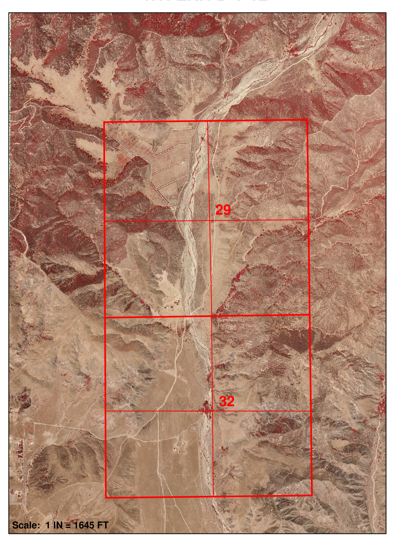
T2S, R2E (1996)