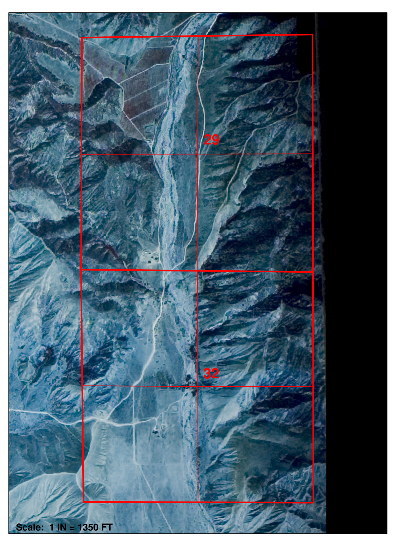
T2S, R2E (1990)