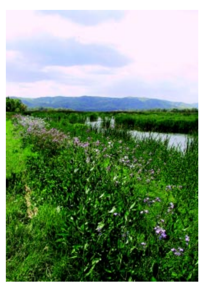
Prado Wetlands

The SAWPA Commission will adopt this document as part of the Integrated Watershed Plan for the Santa Ana River Watershed and will use it to guide funding and development priorities.