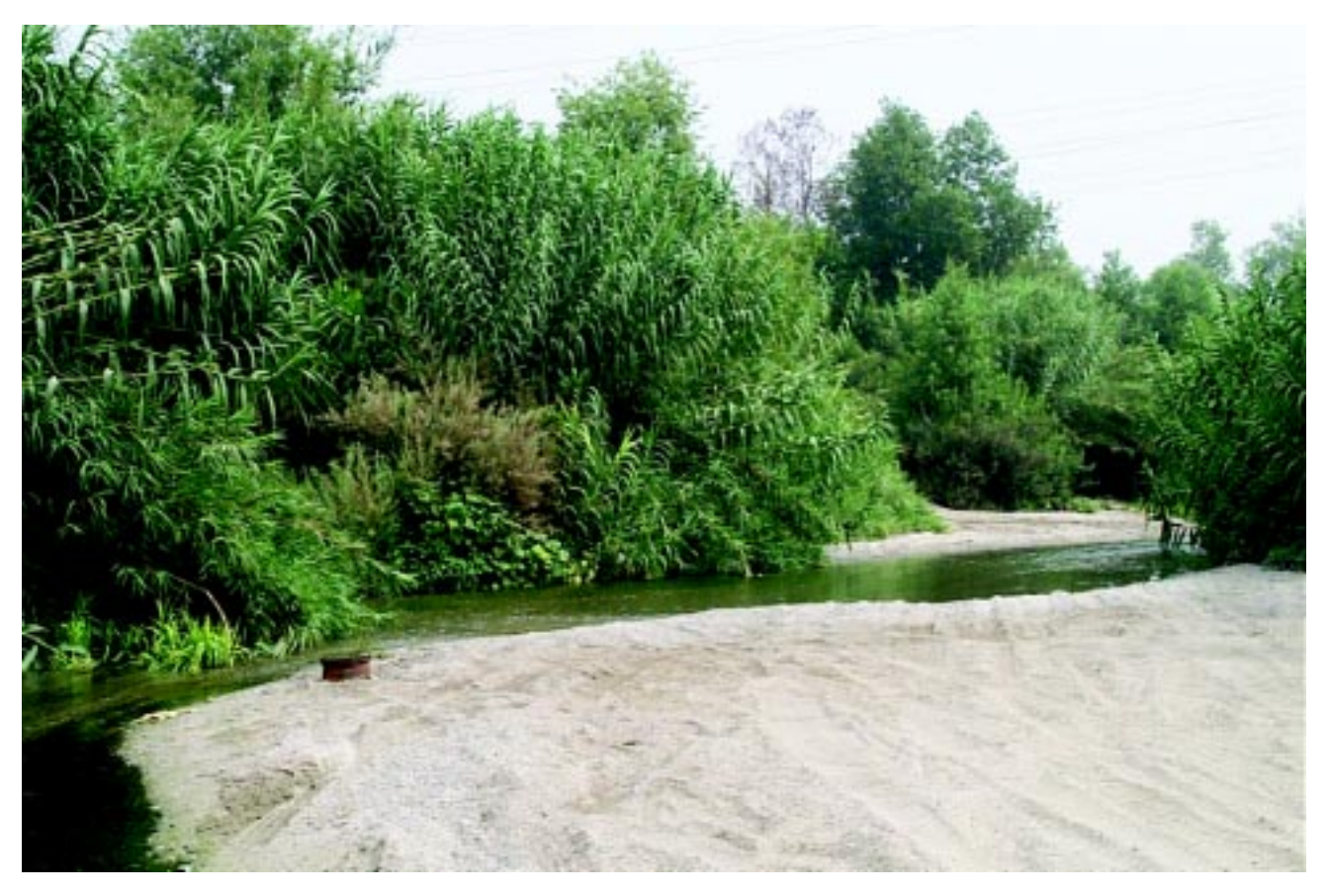
Santa Ana River, San Bernardino County, near the proposed Santa Ana River Trail Alignment.

The dynamic nature of projects and plans in the Watershed necessitates their update and renewal on a relatively frequent basis. This Plan will be