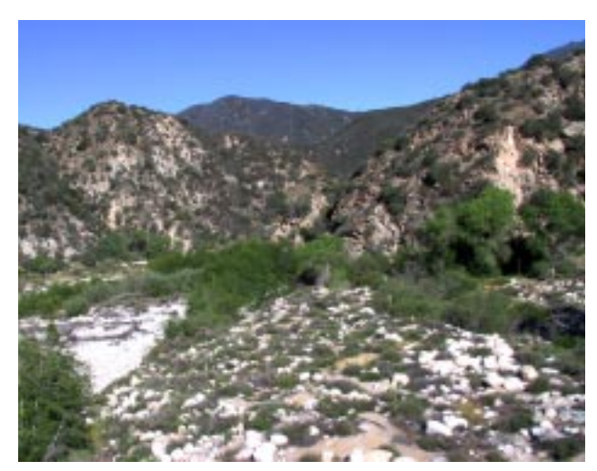
South fork of the Santa Ana River

Outcome indicators are a useful way to measure change within an area. In this case, outcome indicators are used as part of the Santa Ana Integrated Watershed Plan, Environmental and Wetlands Component to measure changes in the Santa Ana Watershed as a result of the efforts of SAWPA, SAWPA's member agencies, other governmental agencies, and citizens' groups. These changes are the result of projects identified within the plan and other opportunities implemented throughout the Watershed.