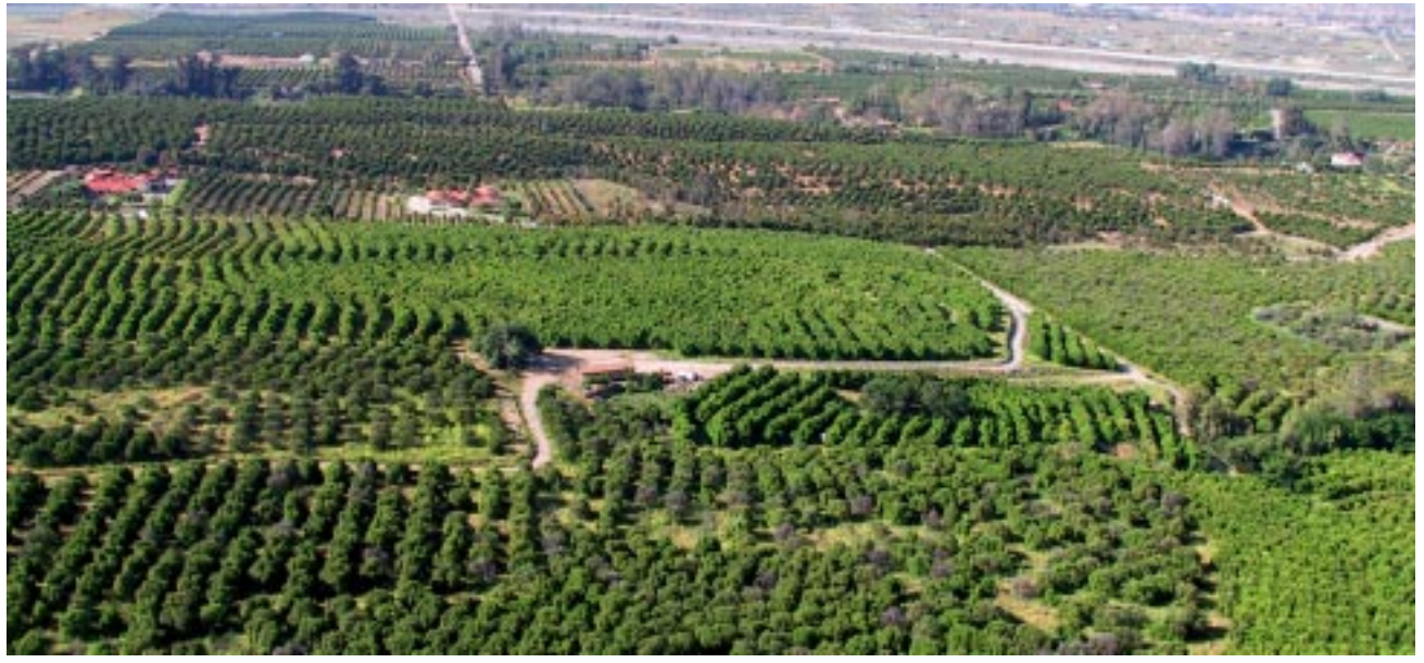
Citrus groves, shown here in the Santa Ana River wash area near Redlands, historically served as an economic base of the Watershed.

The numerous parties making up Team Arundo within the watershed are clearing Arundo from many areas, including the upper tributaries of the Watershed. Section 3A-2 lists Arundo distribution and historical specific removal efforts within the Watershed, as described by Neill and Giessow (2001). Appendix D provides an Arundo Removal Protocol, produced by SAWPA. By providing necessary funding, the Southern California Integrated Water Program Arundo Removal Program will greatly accelerate Arundo removal efforts within the Watershed.