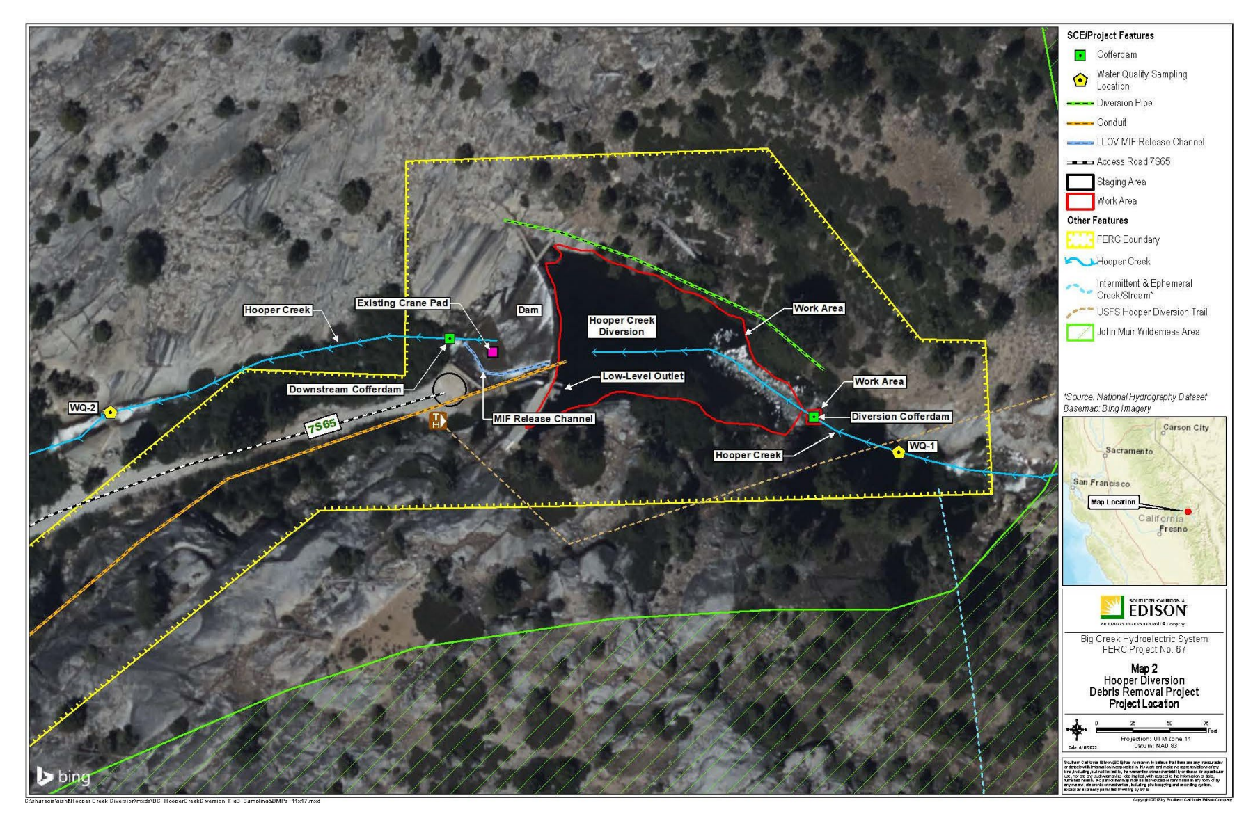
Figure A2. Hooper Creek Diversion Debris Removal Project Footprint and Components (SCE 2022a)