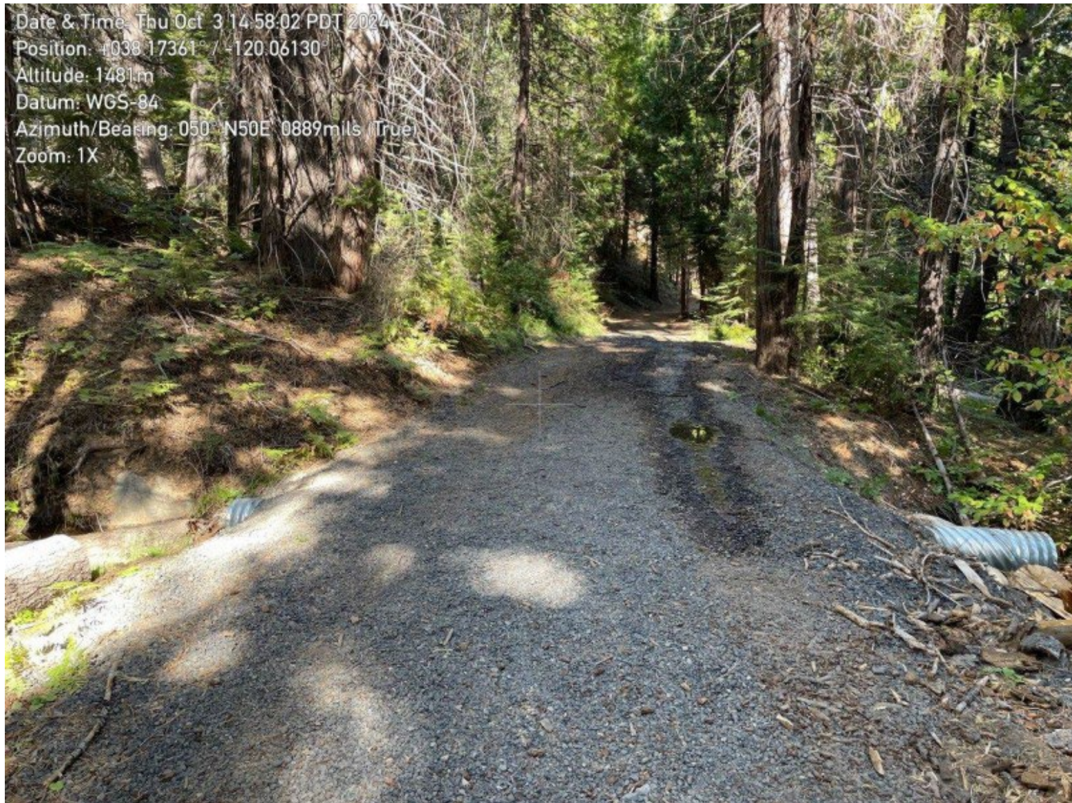
Figure 3: Project Site Post-Construction