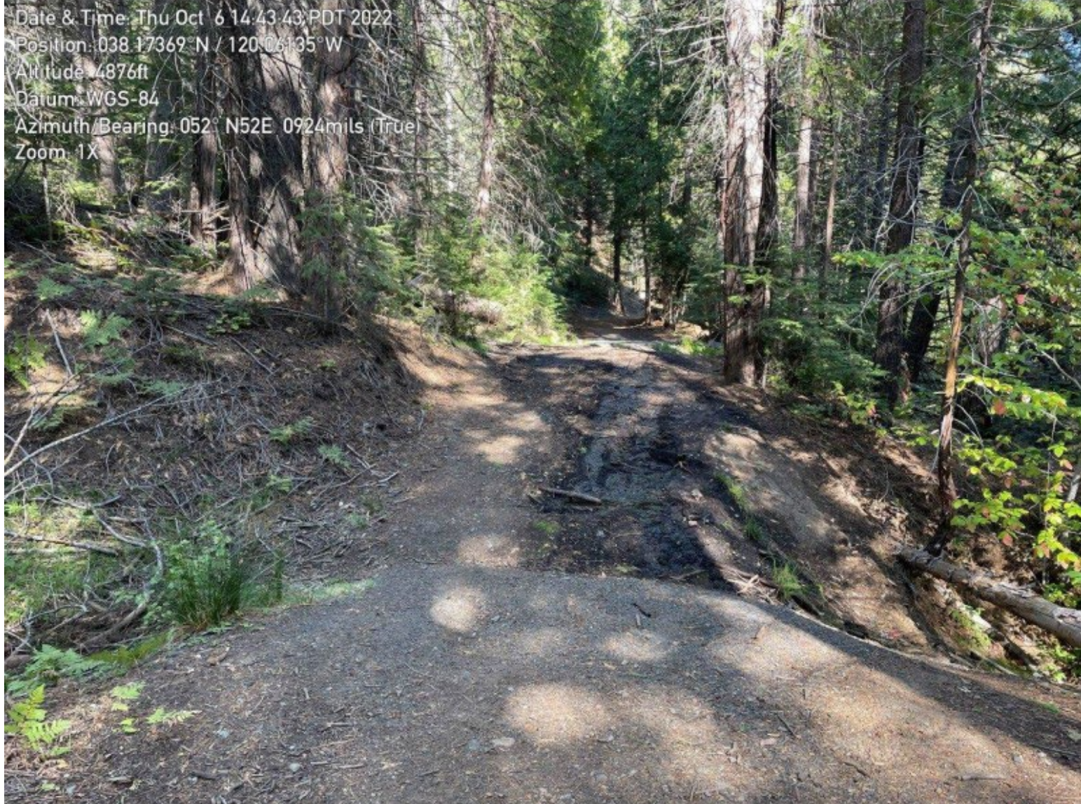
Figure 2: Project Site Pre-Construction