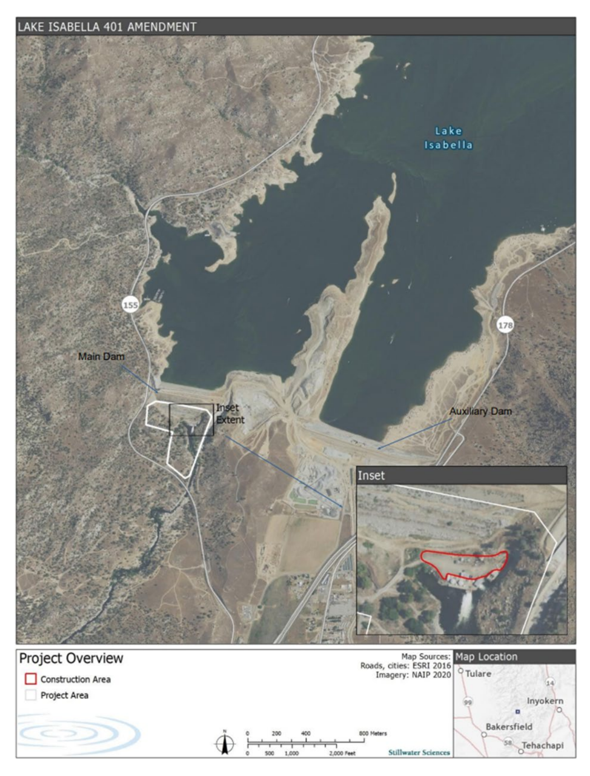
Figure 1-1: Proposed Project Location.