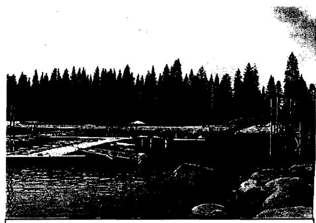
Pinecrest Lake at a lake level elevation of 5608