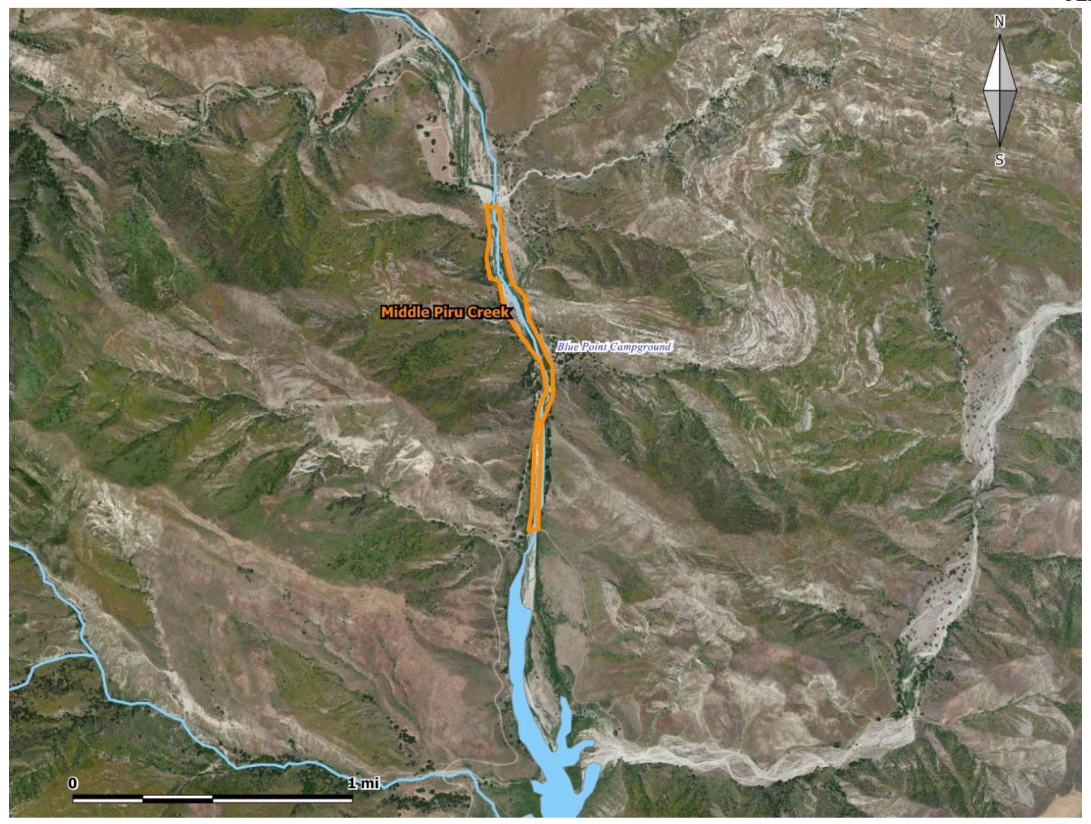
Figure 3 - Reach of middle Piru Creek where two pool monitoring sites will be identified during site reconnaissance prior to implementation of monitoring plan.