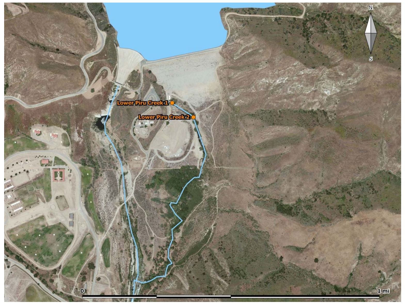
Figure 2 - Locations of monitoring sites at Lower Piru Creek.